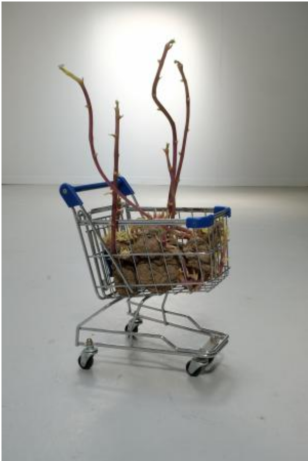
new growth, 2022 patience in the dark, big nor small