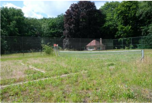
'Lawn Tennis' in the artshow Pioneers at former Royal Palace Soestdijk, 2022 reatauratie // nature conservation, tennis court