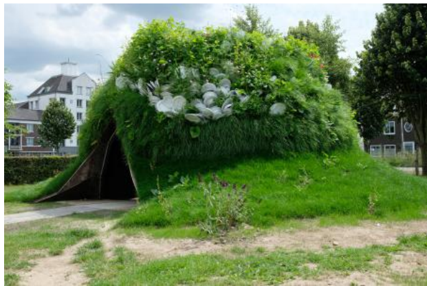
Bee Ambassy, 2022