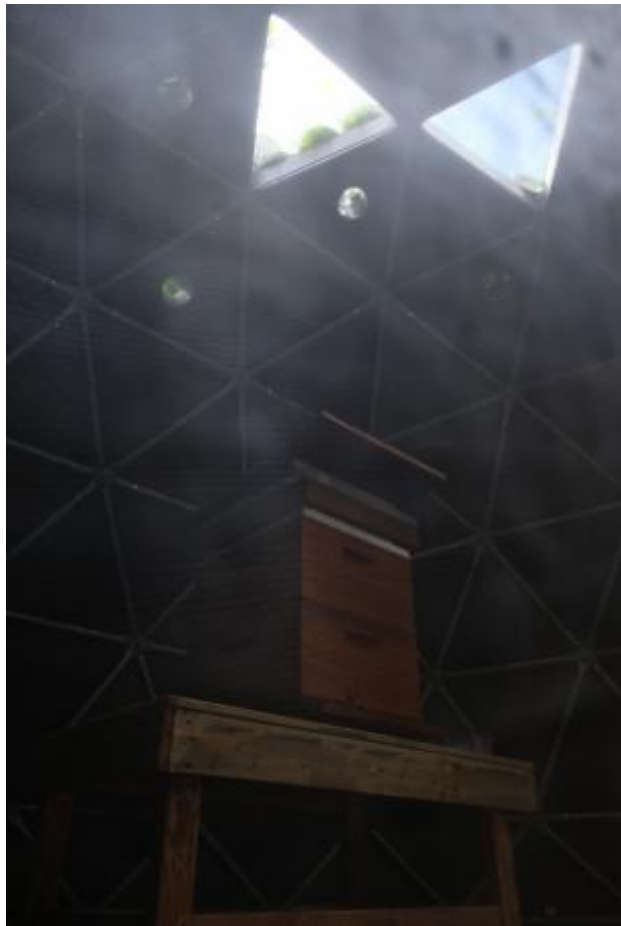
Bee Embassy, 2022