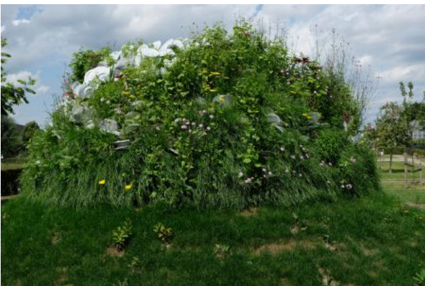
Bee Ambassy, 2022