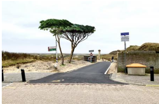
Zandvoort's Gate, 2022 Landscape, until the horizon and sunset