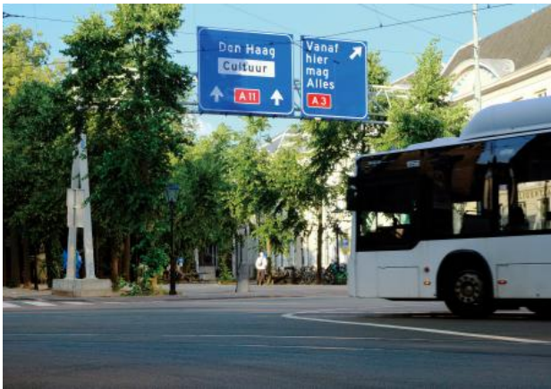
From here on Everything is allowed (sketch), 2023 Road-sign, 15 meters across 7 meters high