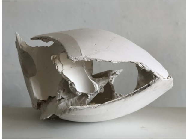
headhouselight 011, 2019 plaster, 70 x 80 x 35cm.