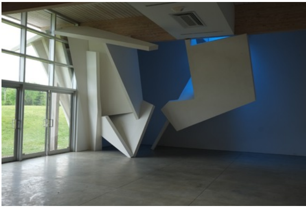
Persona, 2017 Wood, plasterboard, plaster, blue foil, 15 x 5 x 3.5 meters