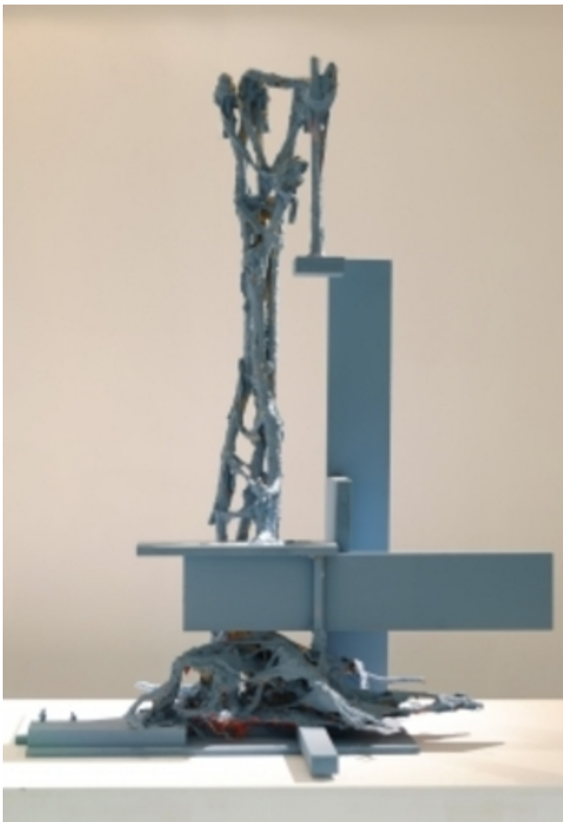
Nature loves modernism, 2013 takken, MDF, latex verf, 140 x 70 x 40cm.