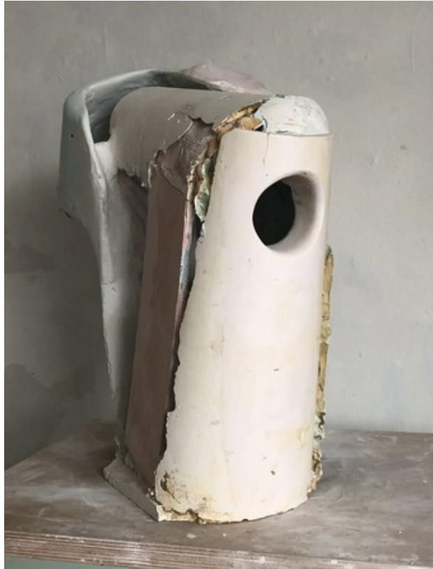
Headhouselight 04, 2018 plaster, pigment, 80 x 70 x 40cm.