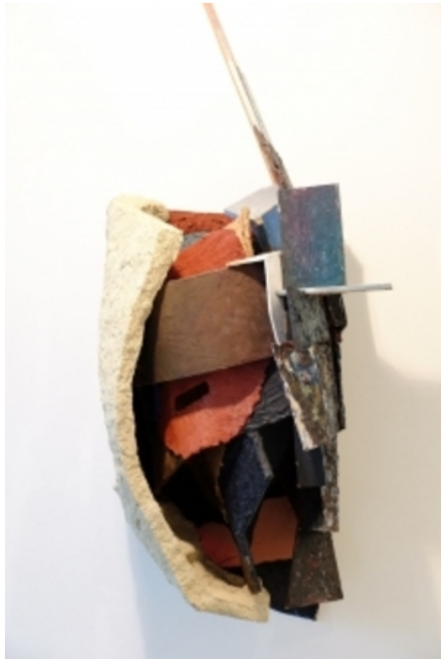
Masker, 2013 hout, karton, olieverf, 140 x 50 x 50cm.