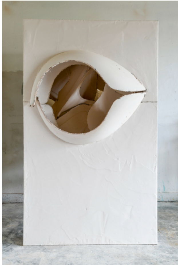
Inner vision, 2020 Acrylic One, 125 x 165 x 245cm.