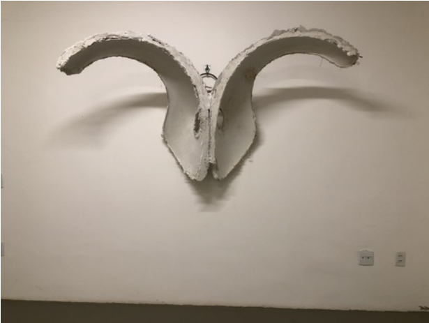
Axis, 2019 Plaster, Steel, 200 x 120 x 45cm.