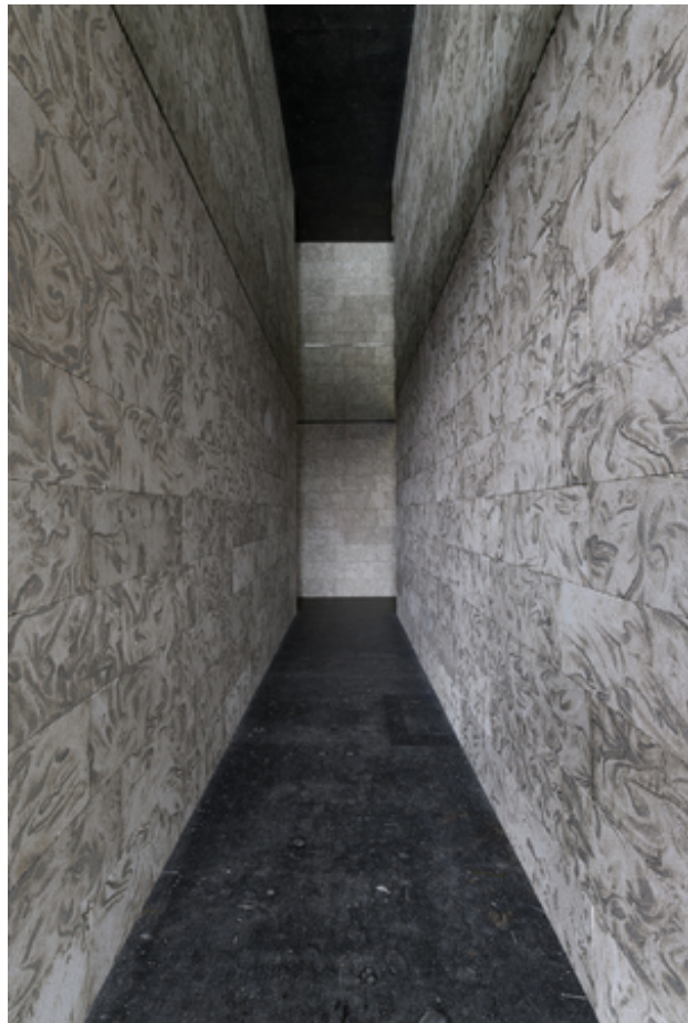
Stride 2017 - 2018, 2018 ytong blocks, aluminium rooftop coating, mirrors, dimensions variable