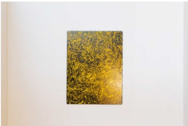
'The Main Remain' 1988-2014, 2014 reflecting sheet, metal, black block out, 132,5 x 110,5 x 2,6 cm