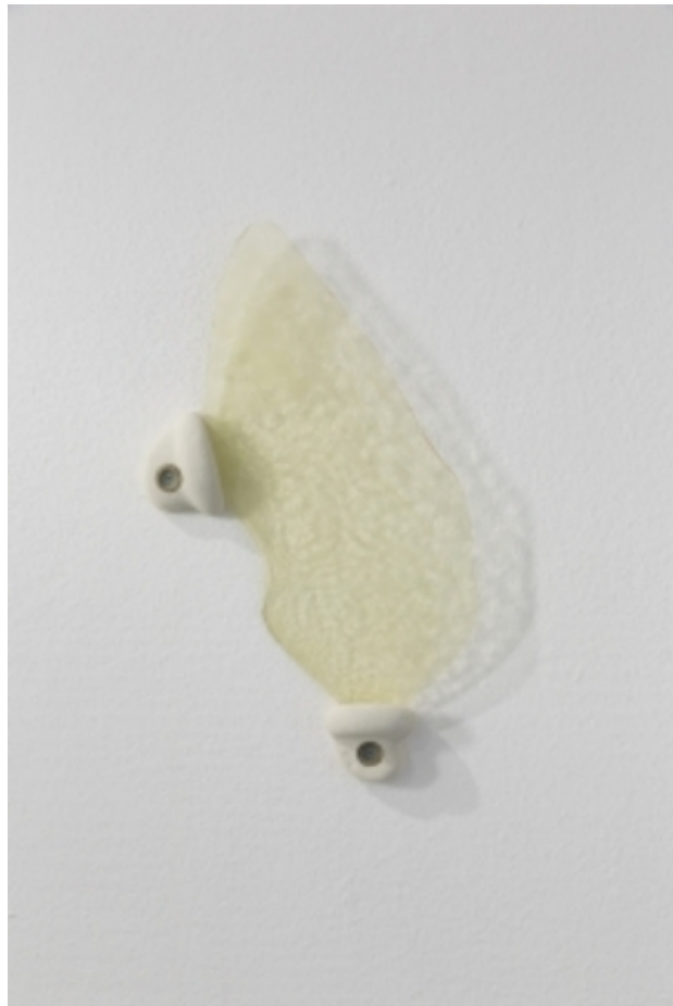
'Untitled', 2014 Indoor climbing grips, custom cast glass, 41x19x4