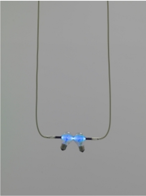
'Untitled', 2014 argon gas, light bulbs