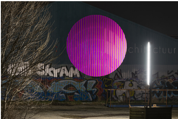
Our Dot 2010-2019, 2019 reflector tape, lights