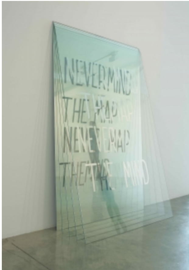
'Untitled (Never mind the map never map, 2013 scrubbed mirrors