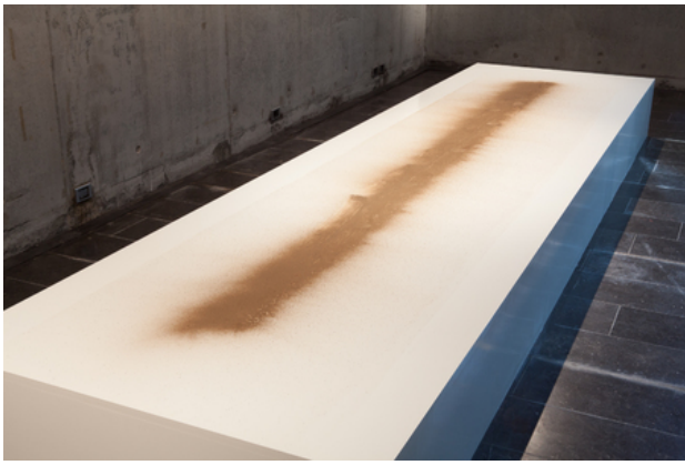
Post Parallelism 2017, 2017 Meteorite dust, moonwalk, dimensions variable