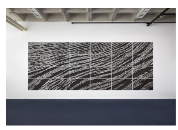
Other Orebody, 2020 graphite on paper on foil, 503 x 191 cm