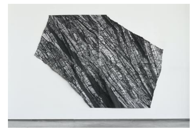
Rough Cut No. 1, 2021 graphite on paper on foil , 140 x 200 cm