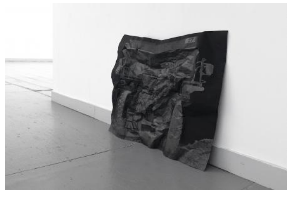
Komatsu Krumple, 2022 silkscreen on paper on foil, 50 x 65 cm