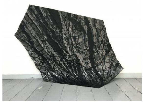
Rough Cut No. 2, 2021 graphite on paper on foil, 140 x 220 cm