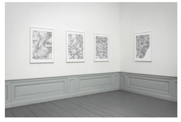
Current Knowledge, 2022 pencil on paper, each drawing 83 x 59 cm