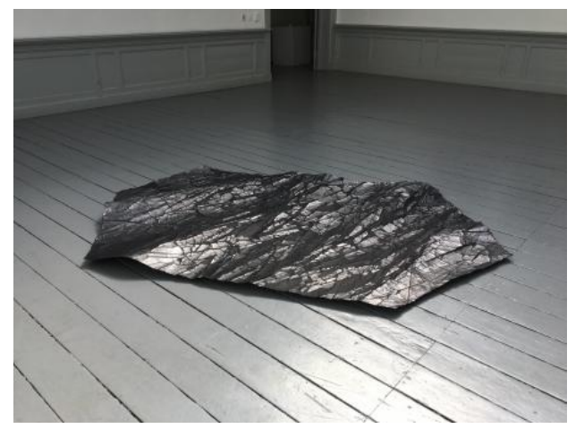
Rough Cut No. 3, 2022 graphite on paper on foil, 140 x 235 cm