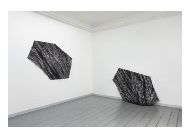
Rough Cut No. 1 (left) and Rough Cut No. 2 (right), 2021 graphite on paper on foil, 140 x 200 cm and 140 x 220 cm