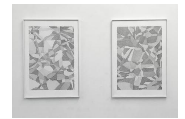
Current Knowledge, 2022 pencil on paper, each drawing 83 x 59 cm