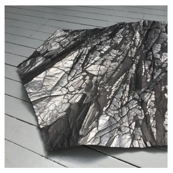
Rough Cut No. 3, 2022 graphite on paper on foil, detail