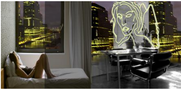
pixells dream of being real, 2023