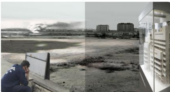
the grand view, 2021