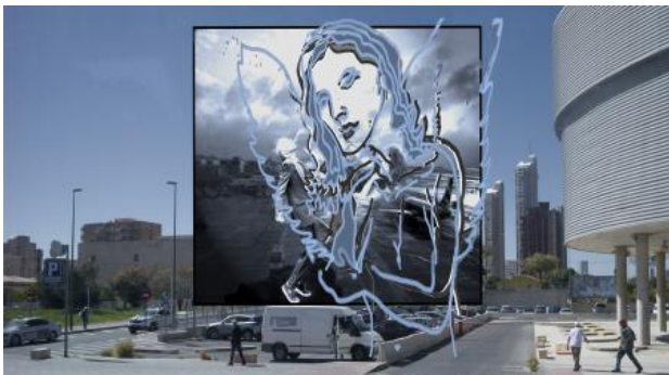
as above so below, 2022