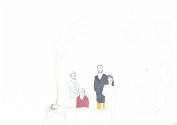
Family series 33, 2020 Drawing, 70x50cm

2004 - -- Curator/ Co-Director at 1646, www.1646.nl On-going