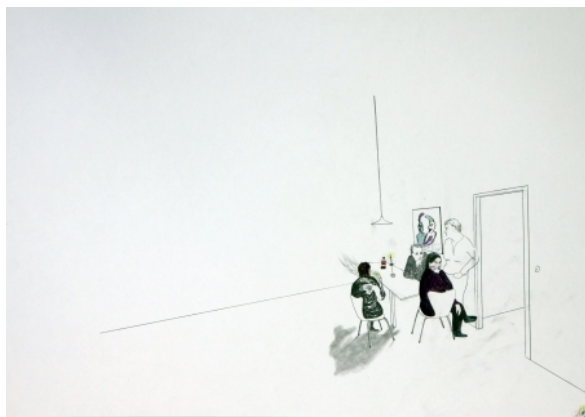
Family series 12, 2010 Drawing, 50x70