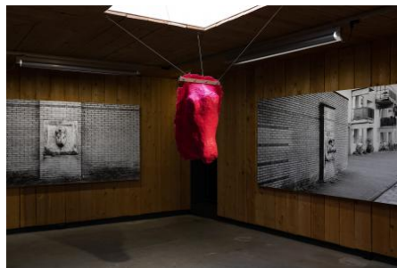
MUDDY PINK DINOSAUR, the exhibition, 2022