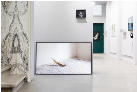
MUDDY PINK DINOSAUR, the exhibition, 2022