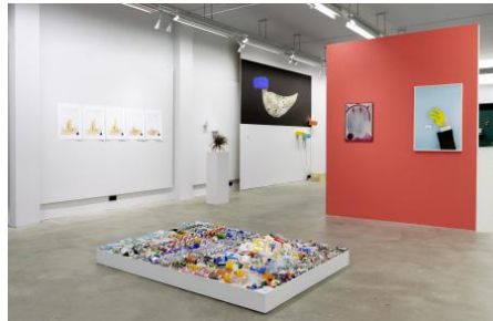
MUDDY PINK DINOSAUR, the exhibition, 2022