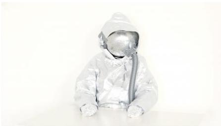
Videostill uit Space S, 2022 video 05:28 min., variabel