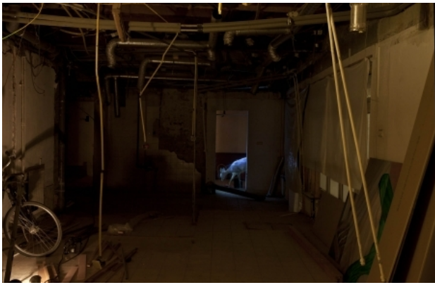
Verschijning, 2014 verschijning