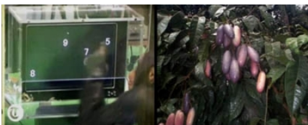
Constellatie, 2010 video met gesynchroniseerde diashow