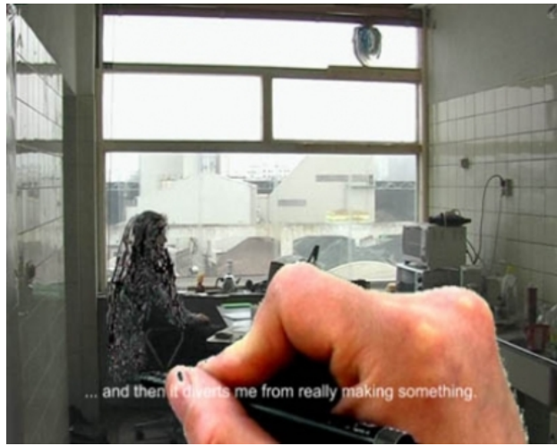
Euhmm, 2010 video