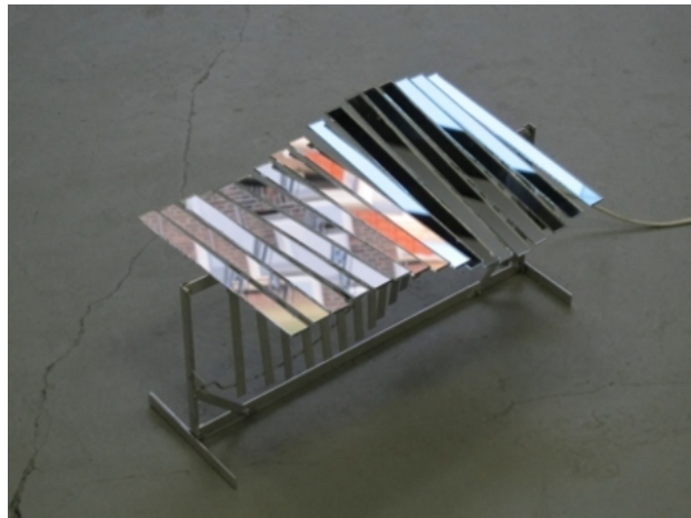
Detail is a minor thing 2, 2013 bewegende sculptuur