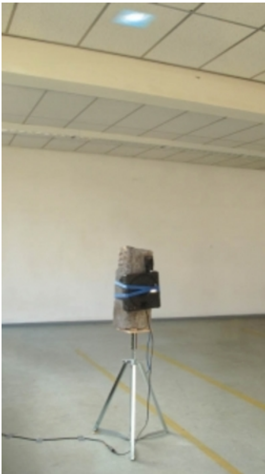
Against Pragmatics, 2009 installatie