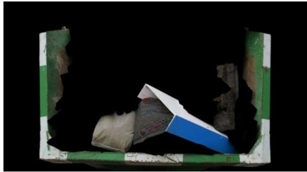
Container, 2012 video