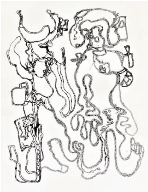
Healer I, 2022 Oilpainting on acrylic foil, 1,2 x 0,8 m