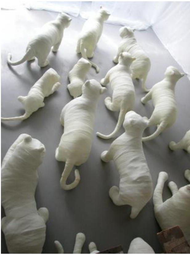
Heaven Revisited, 2016 Video Installation, 1,8 x 2,8 m