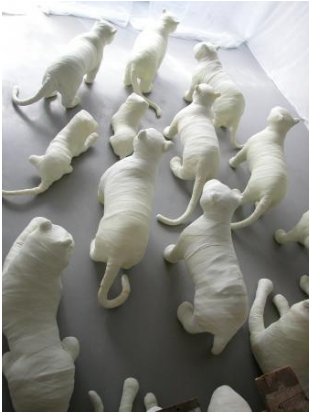
Heaven Revisited, 2016 Video Installation, 1,8 x 2,8 m