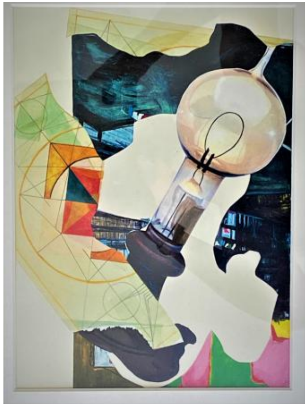
Wolfram I, 2023 pencil mixed technics, 0,4 x 0,25 m