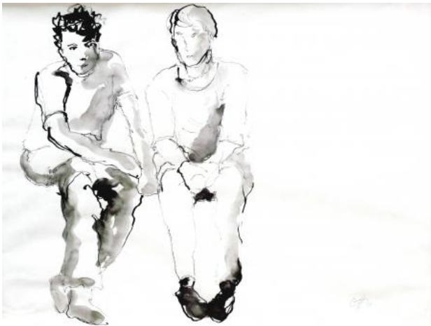
Not about You, 2016 Ink, 0,6 x 0,8 m