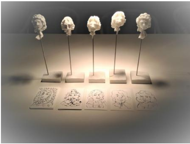
Noble Constantine, 2021 3D Print technique, 0,1 x 0,2 m