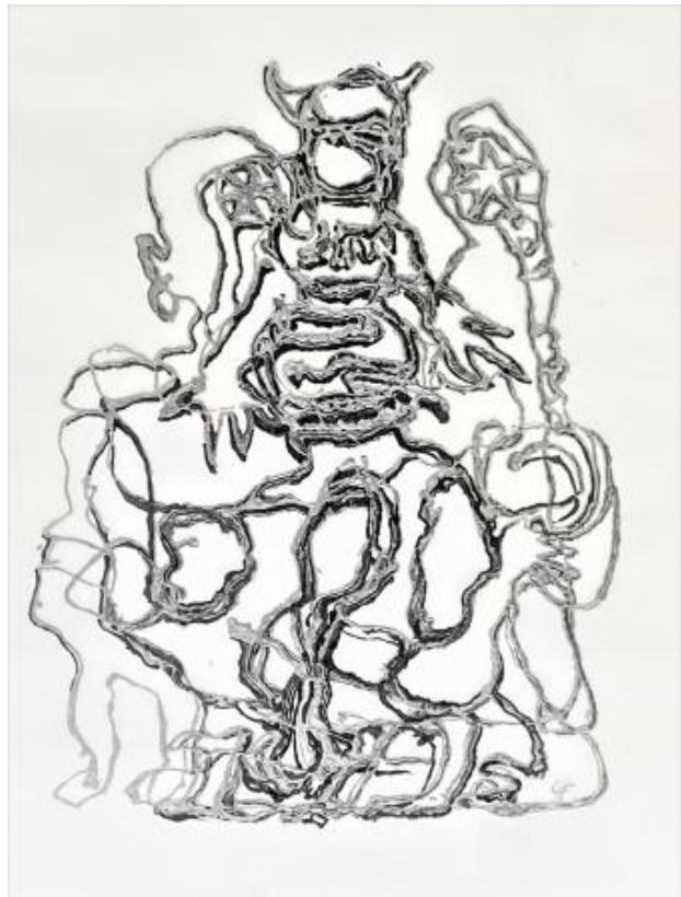
Healer III, 2022 Oilpainting on acrylic foil, 1,2 m x 0,8