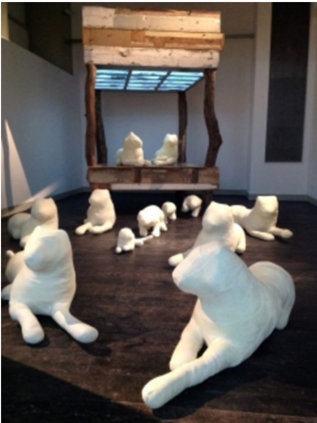
Allegory Splinter Revisited, 2016 Mixed Media, 3,2 x 6 m