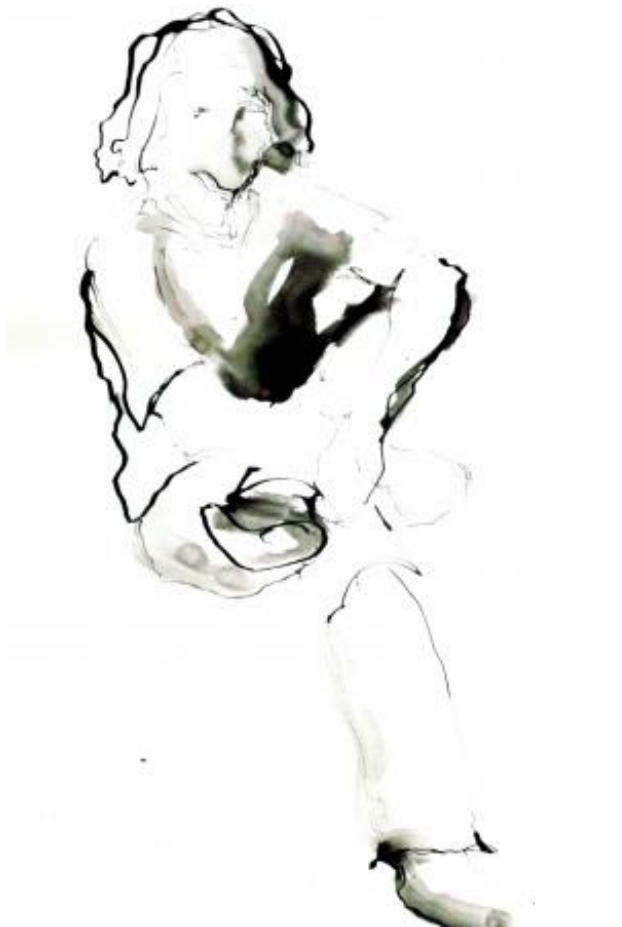
Not about You, 2016 Ink, 0,6 x 0,8 m