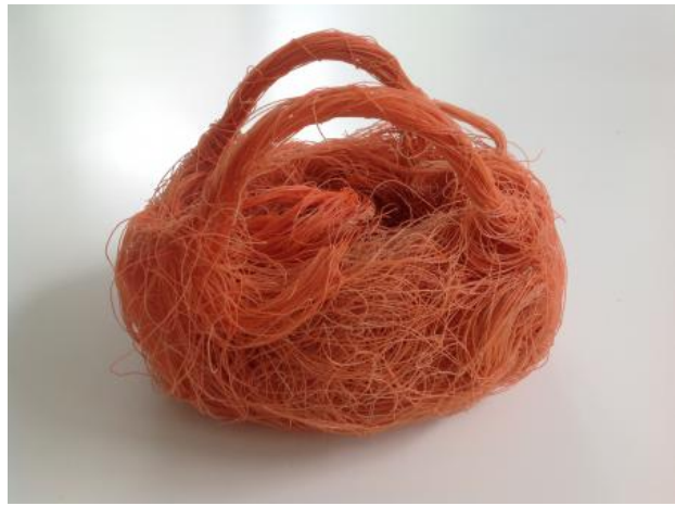
Luxury Nature Goodie Bag, 2020 Garbage material, 0,3 x 0,4 m