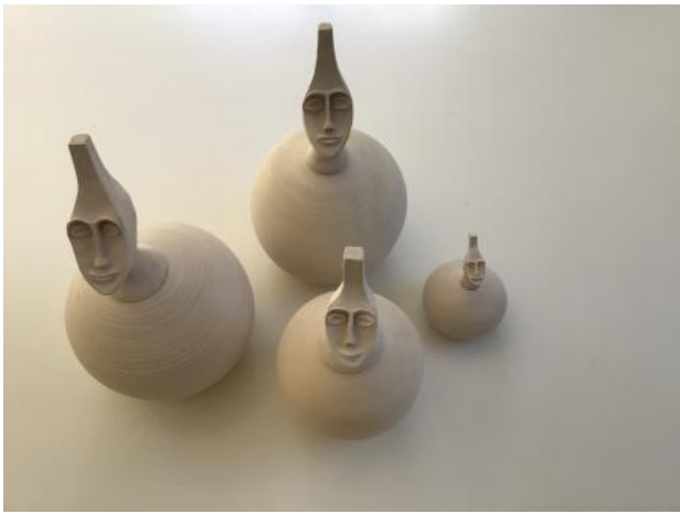
African Nuptials, 2023 Ceramic Clay, 0,4 m x 0,3 m