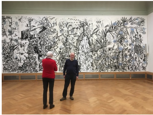
Blik op Candide, 2019 tekening/schildering, 400cm x 1040cm