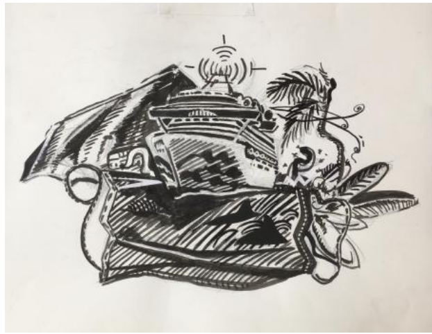
covid1, 2021 inkt tekening, 50cm x 37cm