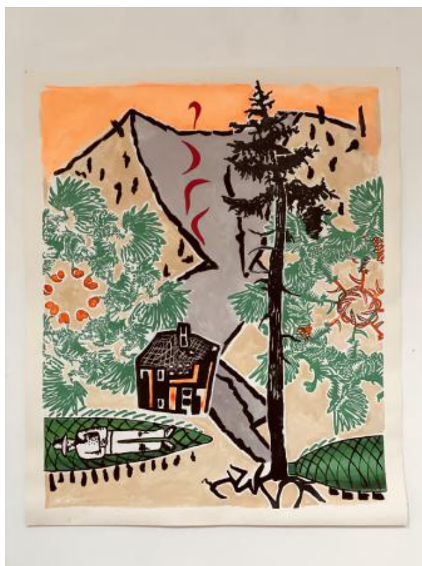
HKK kerstshow, 2022 acryl, inkt, 140cm x 120 cm