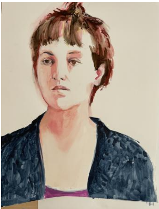
Loona, 2022 gouache, 70cm x 50cm

2018 - -- organisatie van modeltekengroep HKK On-going