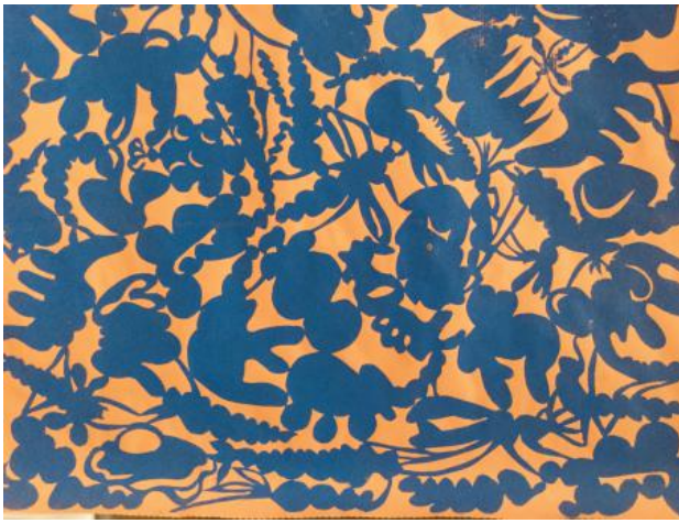
larve, 2020 lindruk op pakpapier, 60cm x 80cm