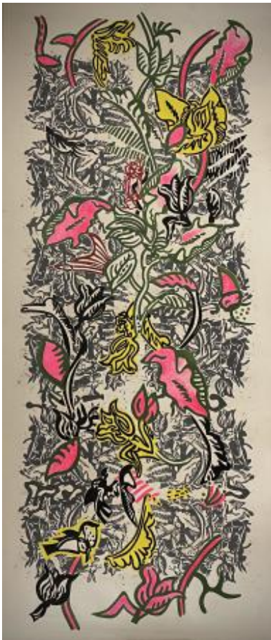
geen titel, 2021 silkscreen afdruk acryl en inkt schilderen, 140cm x 250 cm