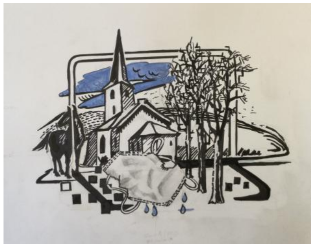
covid2, 2021 inkt en gouache tekening, 50 cm x 37cm