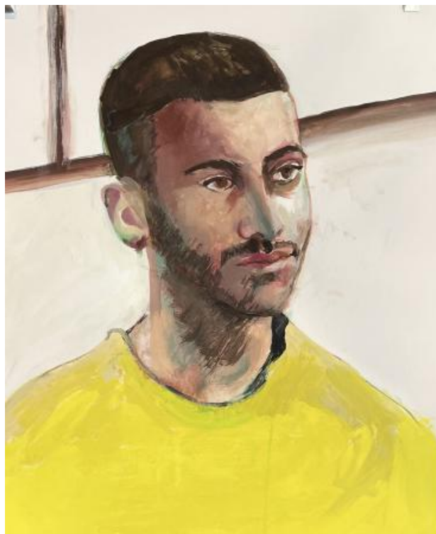
Moris, 2022 gouache, 70 cm x 50 cm