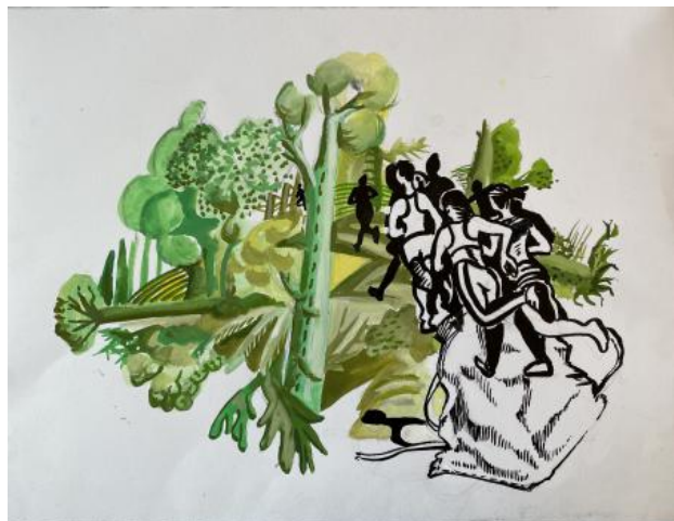
covid4, 2021 inkt en gouache tekening, 50cm x 37cm