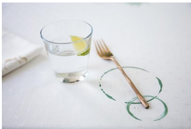
SUSTAINED, 2019 machinaal borduurwerk en handmatige zeefdruk, divers