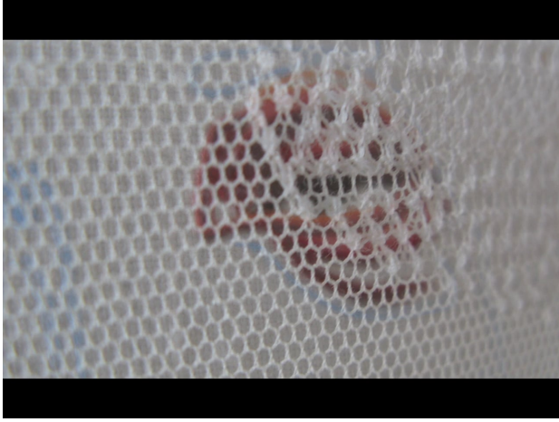
Collateralen, 2016 1 min.