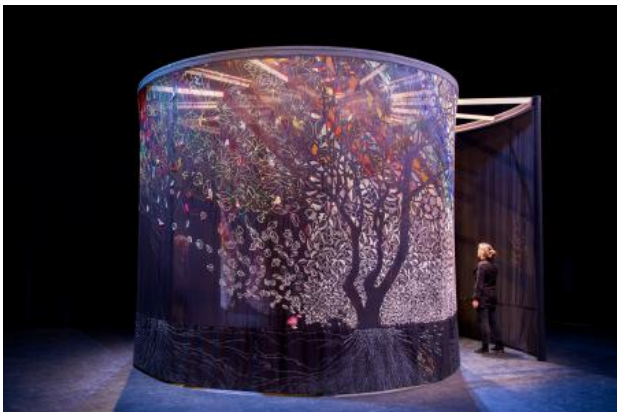
Honderdduizend bomen en een bos van draad, 2021

Van Kade tot Zelfkant, 2022 Diverse technieken, 69 x 944 cm