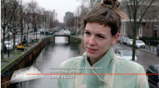
Metropolis Den Haag, 2017 11 min.