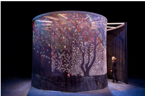
Honderdduizend bomen en een bos van draad, 2021

Van Kade tot Zelfkant, 2022 Diverse technieken, 69 x 944 cm