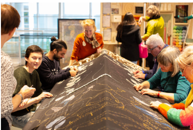
100.000 trees and a threaded forest, 2020 embroidery, 30 x 4 meter