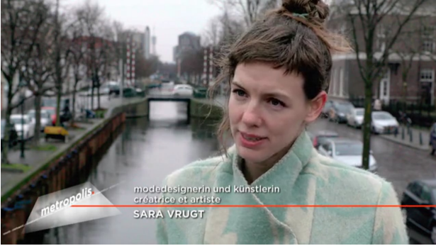
Metropolis Den Haag, 2017 11 min.