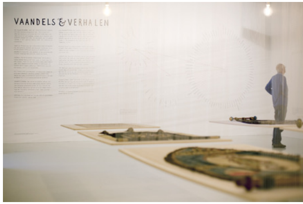
Vaandels en Verhalen, 2017 Gemengde techniek, twee museumzalen vol