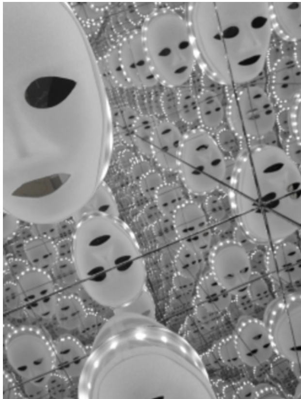
Ik heb zo wa-wa-wa-waanzinnig gedroomd, 2017 Gemengde techniek, 50 x 50 x 50 cm