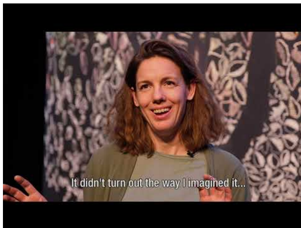
100.000 trees and a threaded forest, 2021 00:17:21

Van Kade tot Zelfkant, 2022 Diverse technieken, 69 x 944 cm