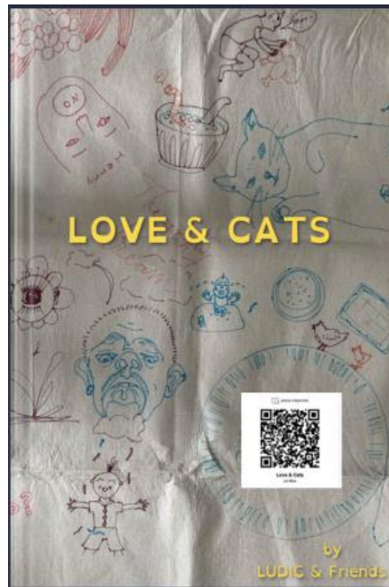
Love & Cats, 2024 online audio visual book, online audio visual book