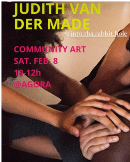
what if we redefine words by experiencing them with our bodies , 2025 community art