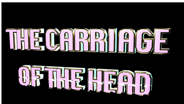
int0.th3.rabbit.h0le, 2022 10-15 min.