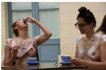
My Body (is)/(not) Your Business Card, 2023 performance