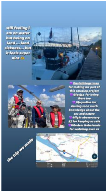
Light Observatory#&, 2023