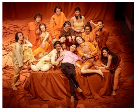
I never wanne dance again, 2024 performance