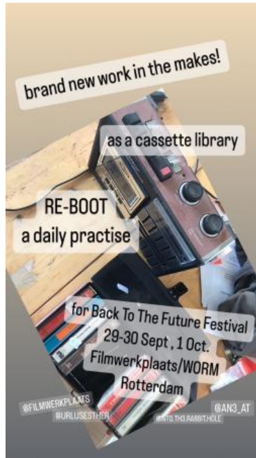
Re-Boot the cassette library, 2023 tapes/ installation