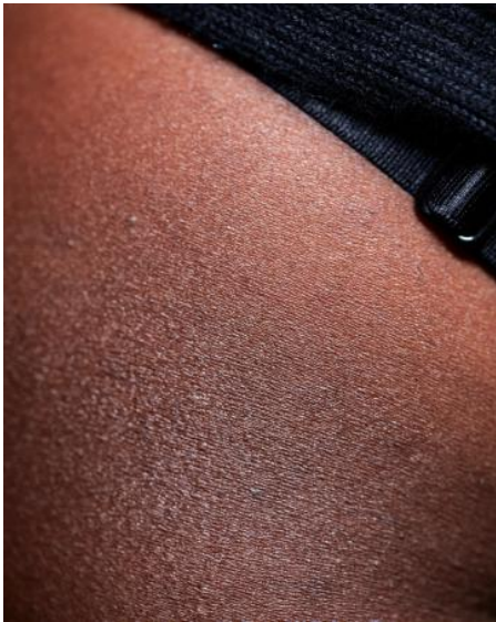
COLOUR, 2024 digital photography, material variable, variable