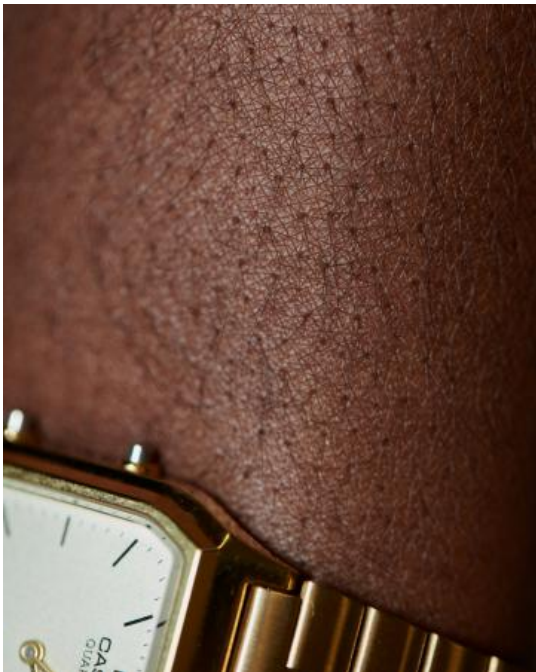
COLOUR, 2024 digital photography, material variable, variable