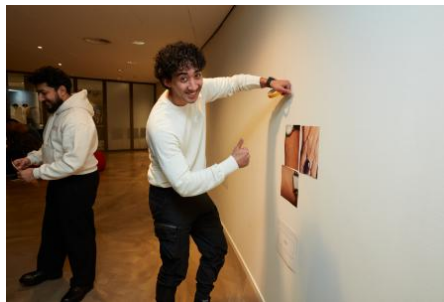
Algorithmic Thinking with Photography, 2024