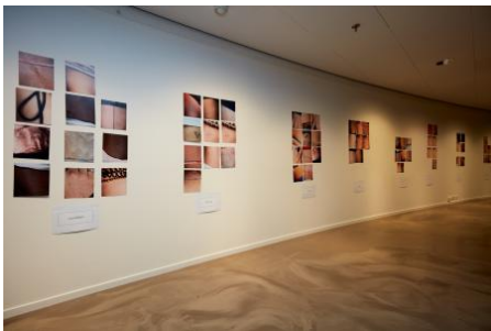
Algorithmic Thinking with Photography, 2024