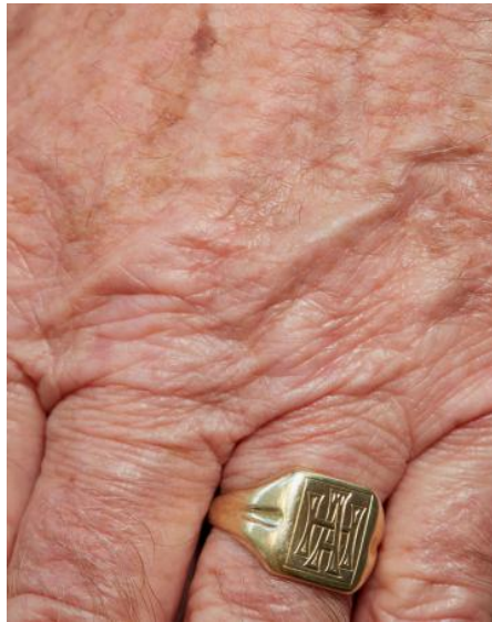
COLOUR, 2024 digital photography, material variable, variable