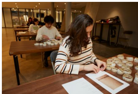
Algorithmic Thinking with Photography, 2024