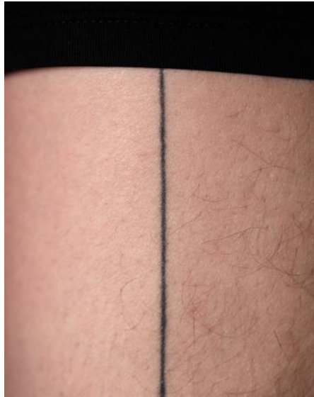
COLOUR, 2024 digital photography, material variable, variable