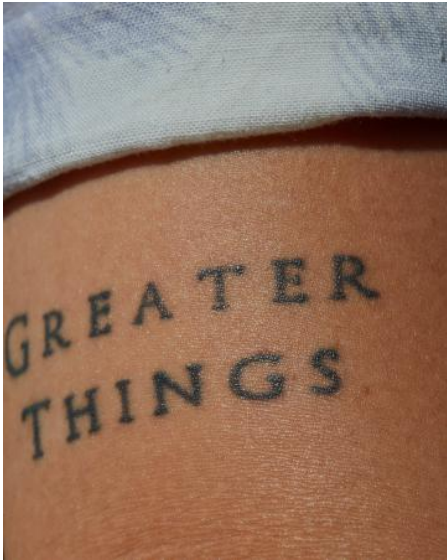
COLOUR, 2024 digital photography, material variable, variable

Studio Johan Nieuwenhuize. Commissioned art and photography projects, concept- and projectdevelopment of cultural projects and books. On-going