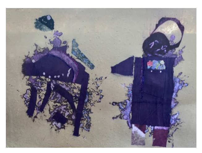
this was a home, 2019 paper pulp painting with shifu, 100x140 cm