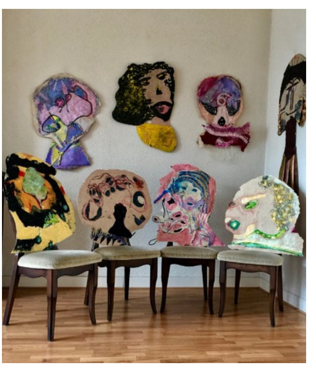
A meeting discussing the future of paper making., 2018 hand made paper, 2x3 meter , installed on chairs and on the wall