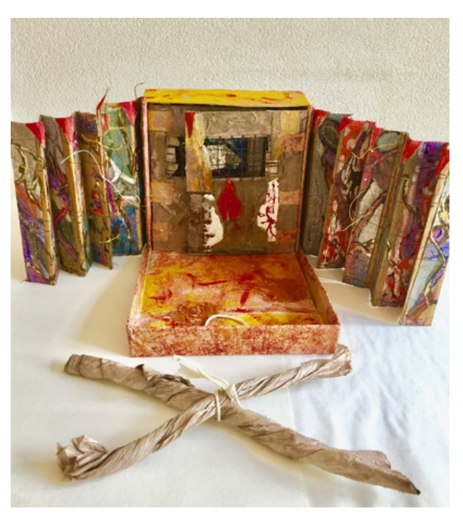
walls are coming down, 2018 stand on table, artist book, 80x 70cm