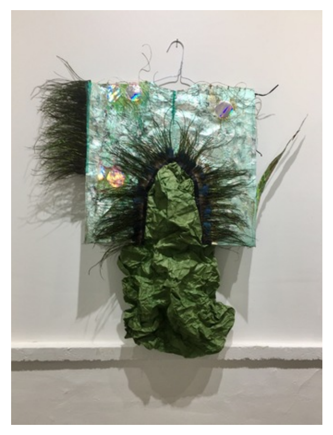
Nature likes recycling, 2017 handmade paper +mixed media, 64x87 cm