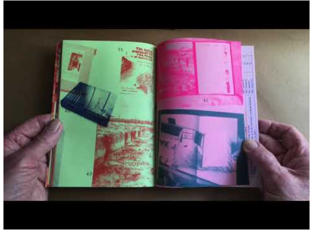
'Fondslijst' Kunstenaarsboeken & zines van T M 2019-20, 2020 1:08