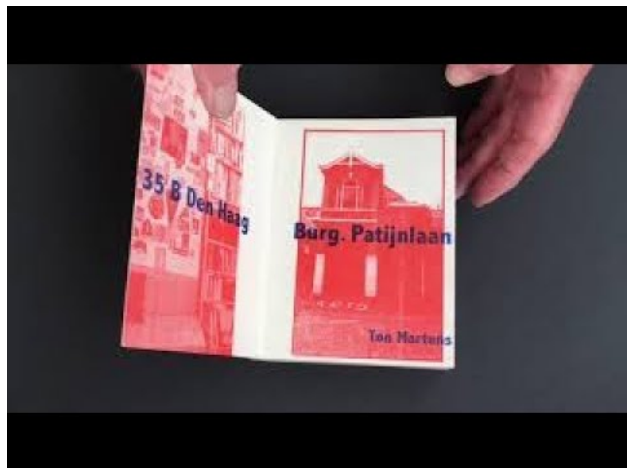
Burg. Patijnlaan 35 B, 2018 2:34