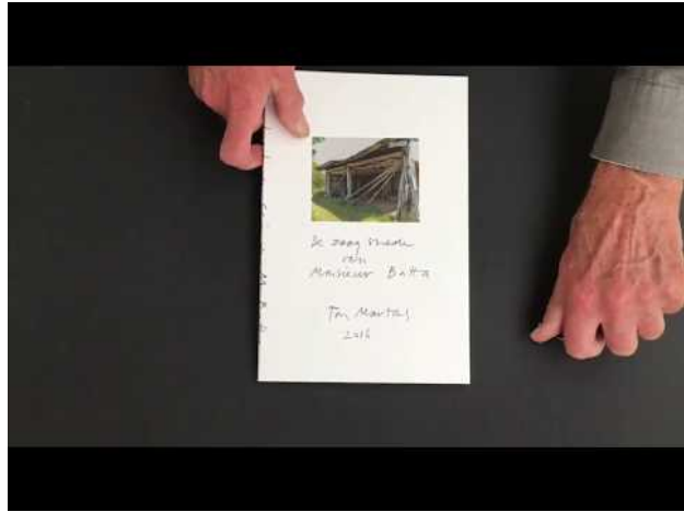
The saw cut by M. Batta, 2018 2:37