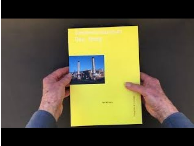
Kunstmuseum Den Haag [Gemeentemuseum Den Haag], 2021 1:56