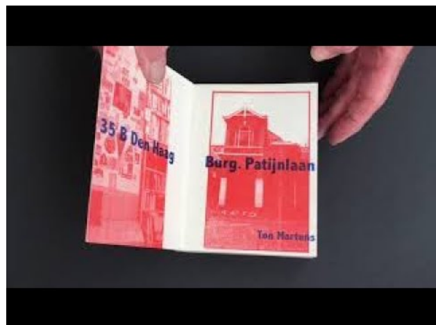
Burg. Patijnlaan 35 B, 2018 2:34