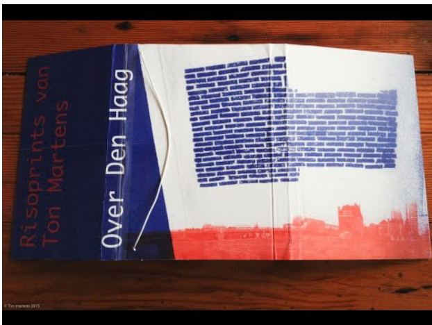
OVER DEN HAAG, 2018 3:03