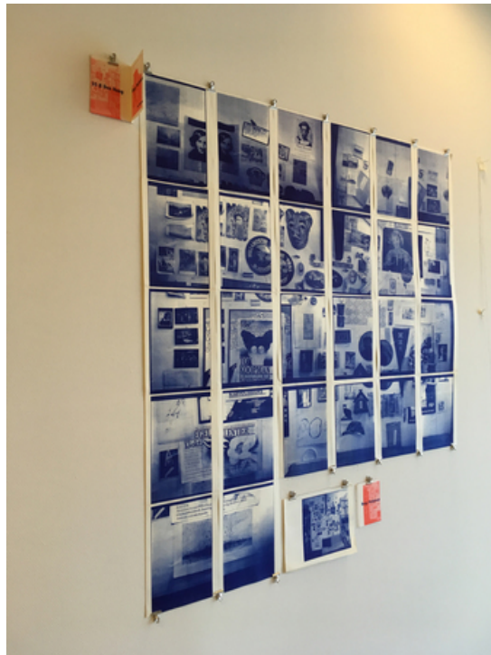
Burg. Patijnlaan 35 b Den Haag, 2018 Risograph