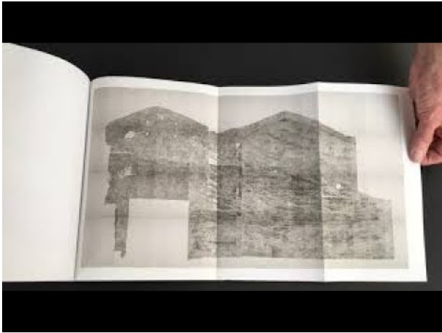
The Paper Monument of The Wall of Nagata-ku, Kobe, 2018 2:13