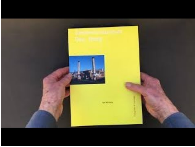
Kunstmuseum Den Haag [Gemeentemuseum Den Haag], 2021 1:56