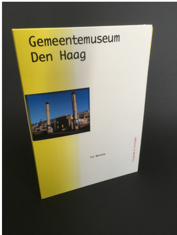
Gemeentemuseum Den Haag, 2018 laser print and hand-tied, 21 x 2,2 x 29,7 cm