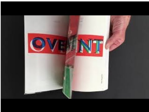
Artists' book: OVER PRINT, 2018 3:21