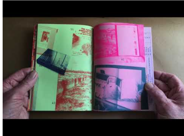
'Fondslijst' Kunstenaarsboeken & zines van T M 2019-20, 2020 1:08