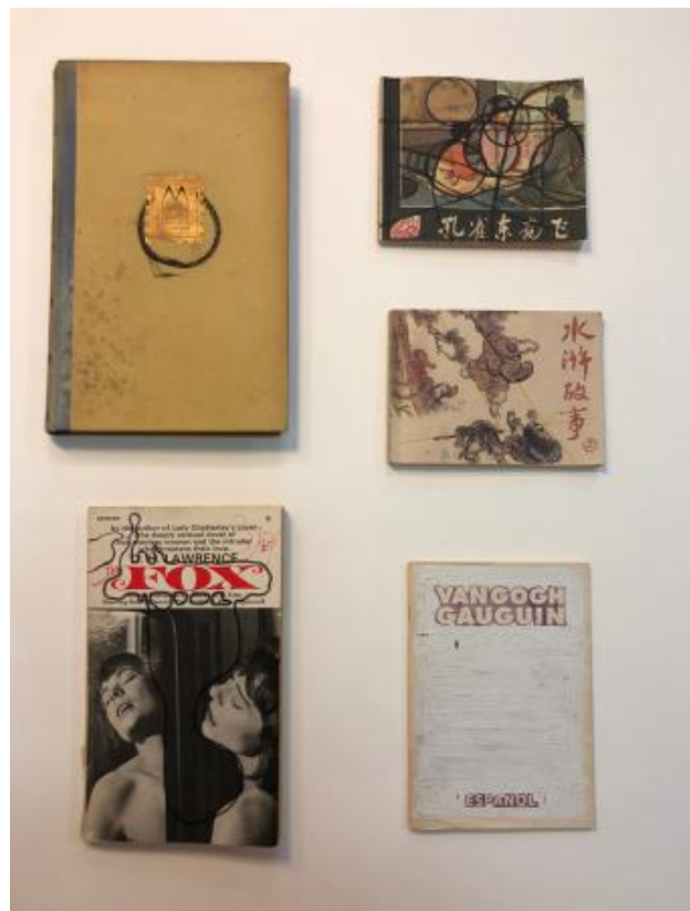
5 artists books, 2022 ink and tip-pex in/on books, various