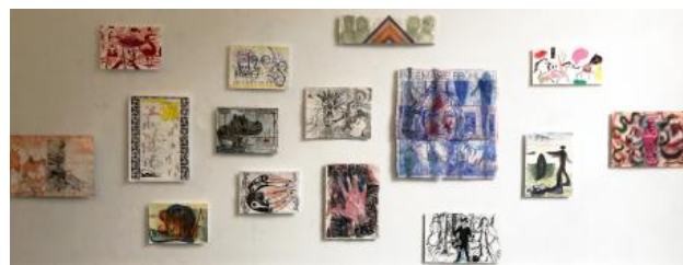
TATO(A)GE expo, 2023 works on paper, various