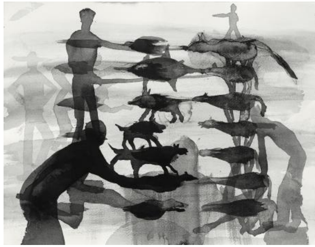
Untitled (animals), 2021 india ink on paper, 25 x 32 cm