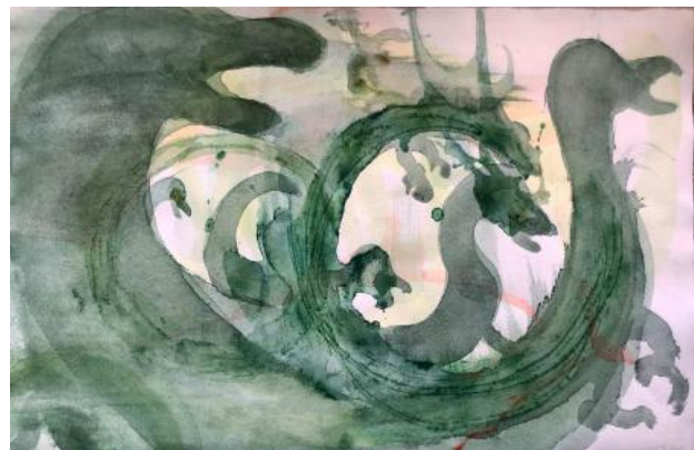
Untitled (dragons), 2022 watercolour, 62 x 48 cm