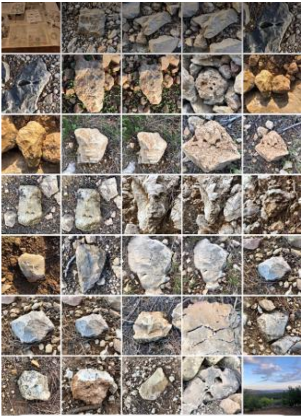
Piedras series, 2023 photography