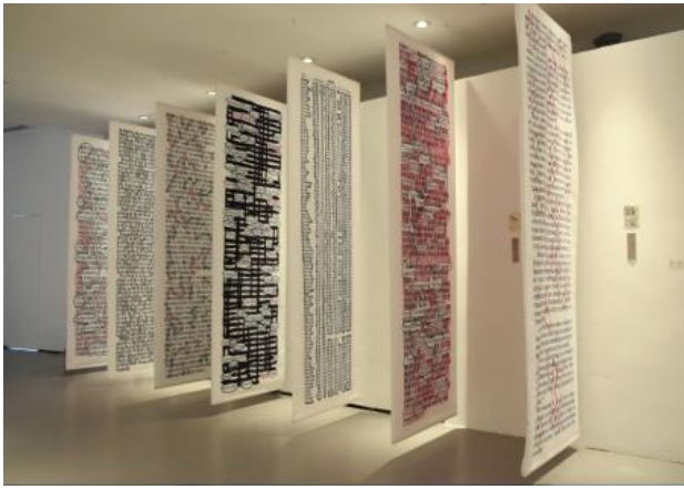
Read the Image, 2022 ink and print on paper, 12 x 3 m