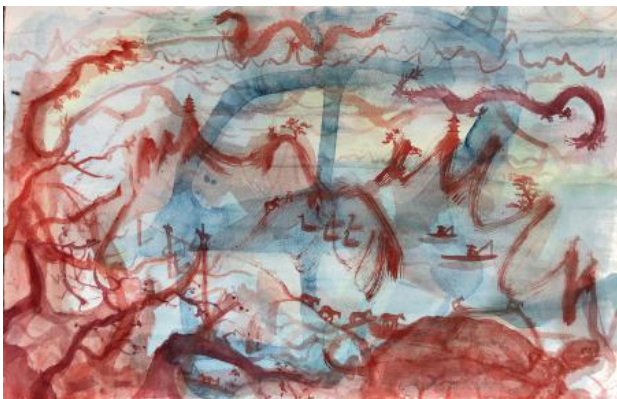
Untitled (Chinese landscape), 2022 watercolour, 54 x 38 cm