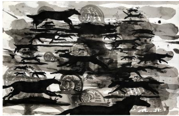
Untitled (race), 2023 India ink on paper, 32 x 50 cm