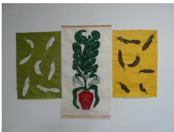
Attack, 2022 coloured woodcut's on Hanji paper, 150 x 200