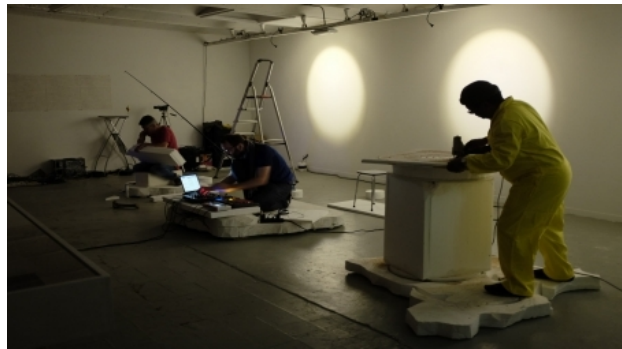
All Saints Boogie, 2017 multi media performance, nvt