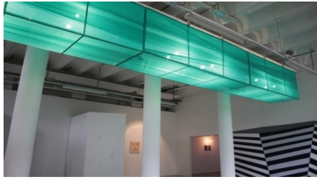
Verlichte Gracht Bovenlangs, 2018 licht installatie, 10x1x1 meter