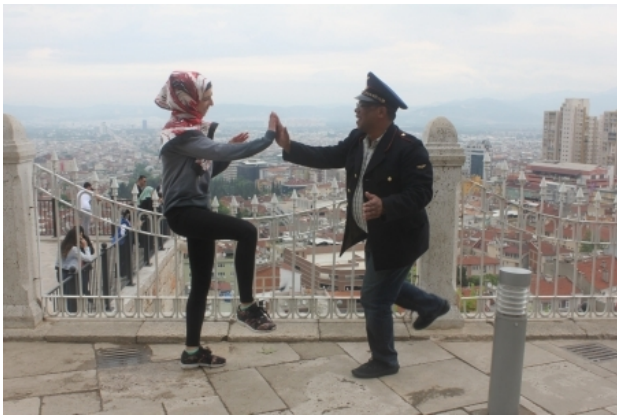
'Oh Maria', 2017 performance