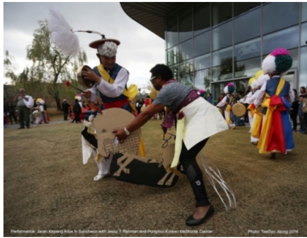
'Jaran Kepang, Live in Suncheon, 2016 performance