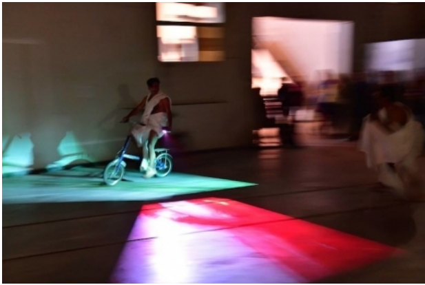
Hot Sand, 2018 video-performance, nvt