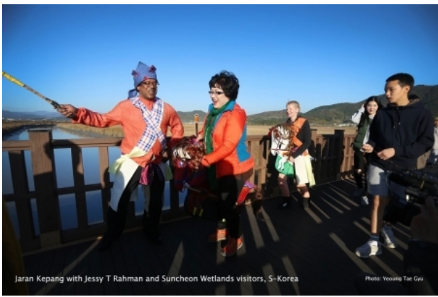
'Excursion to the Nature Play's, 2016 veld werk/dance demonstrations