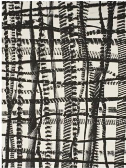
Krijtlijnen, 2023 steendruk, 19 x 28 cm