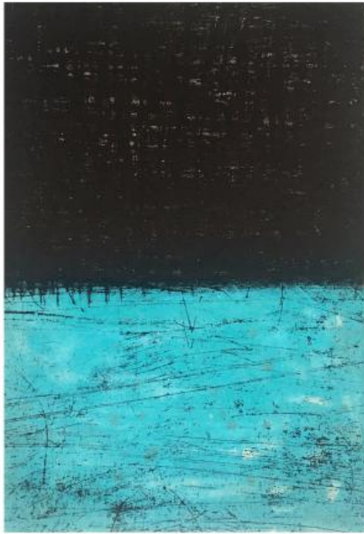
Black & Blue, 2024 Lithography, 28 x 19 cm