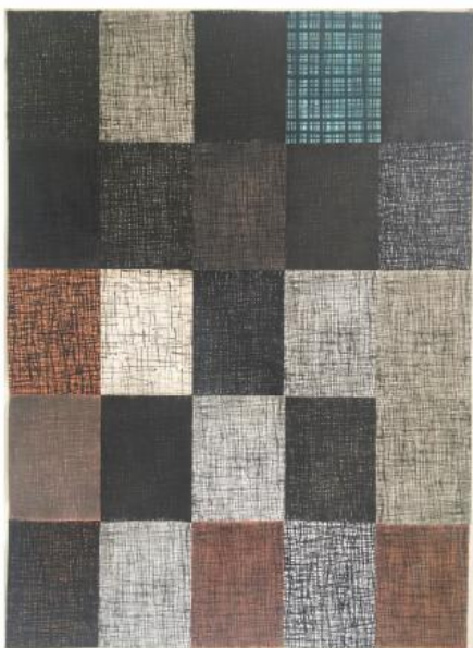
Rasters, 2024 steendruk, 192 x 140 cm

1989 - -- Grafische Werkplaats Den Haag On-going