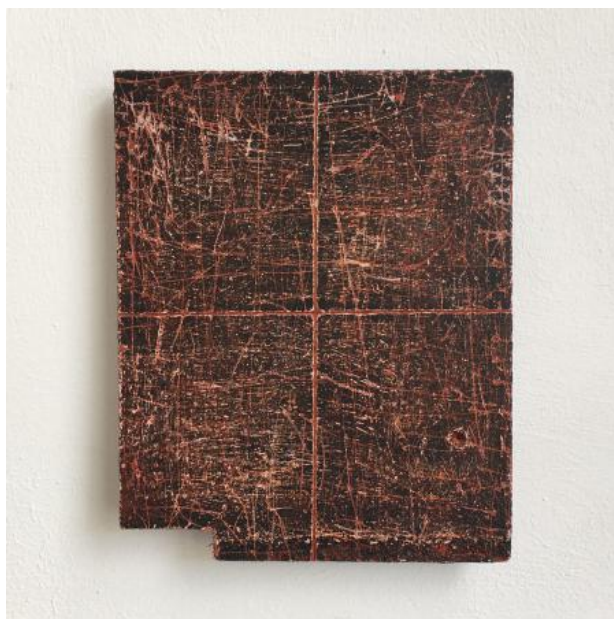
zonder titel, 2024 acryl op reclaimed panel, 24,5 x 19,7