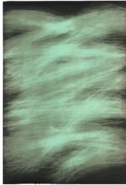
zt, 2022 steendruk, 56 x 38 cm