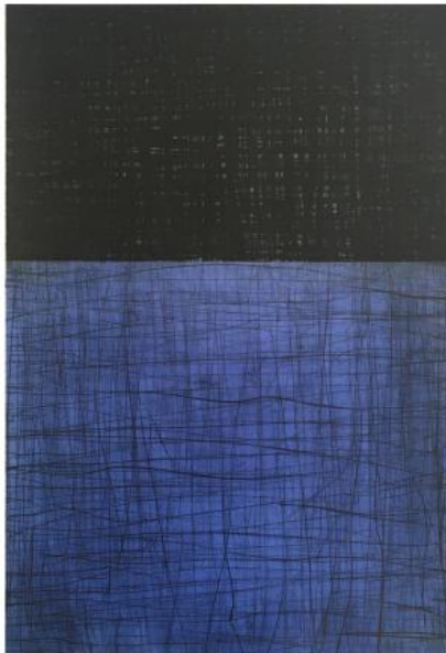
Nocturne, 2022 steendruk , 56 x 28 cm