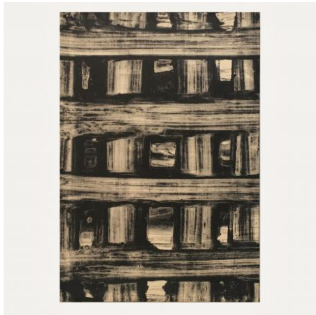
Brushstrokes, 2024 lithography, 19 x 28