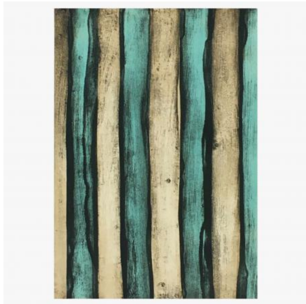
streepjes, 2022 steendruk, 28 x 29