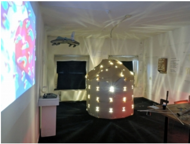
idem, later in de bovenkamers, HKK, 2015 idem, idem