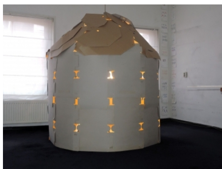
lamp, 2015 assemblage, h 180 cm