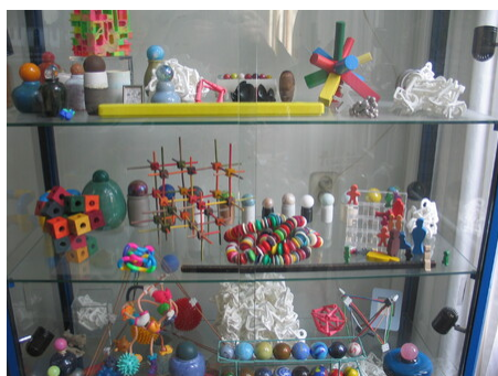
HOME, 2019 n a, 70 x 90 x 40 cm