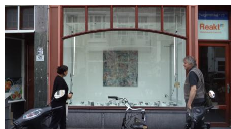
Malrador Gallery, 2021 Mix media, 21x21