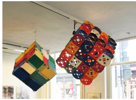
kubus, 2015 assemblage, 32 cm 3