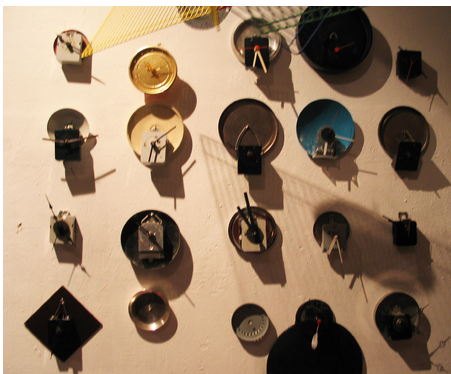
Time, 2013 installation, 100 cm 3