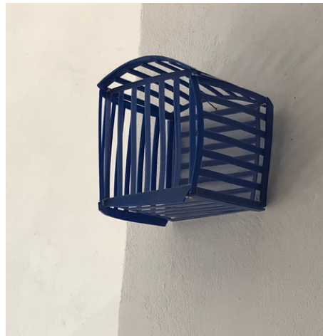
untitled, 2014 assemblage, 12 x 12 x 12 cm