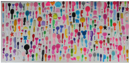
combs, 2014 collection, 70 x 140 cm