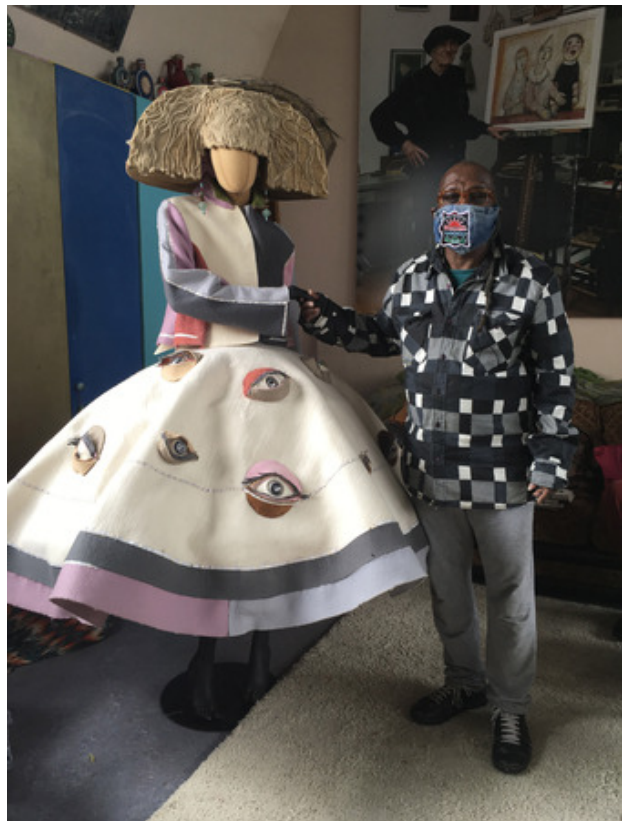
Social Distance dress Eye on You, 2018 mixed media with led light on , 3 m omvang