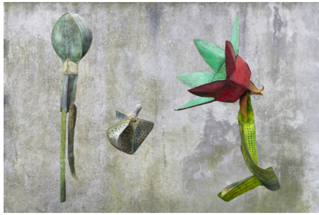
FLOWERS, 2019 mixed media from recycling textile paper and wax, diverse formaten tot 1 m L