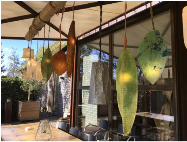
Dreamlight, 2019 gegympte wires, and perforated shapes with led lights, L 10 m