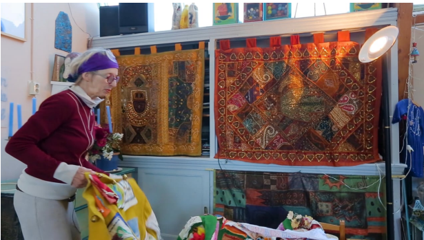
video Klei(n)schaligheid door Tasfilms, 2020 0