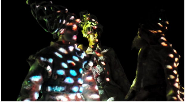
Tribe of Senses, 2016