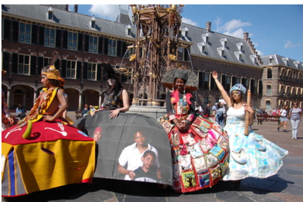
GUN FOR PEACE, 2017 recycled perforated plastic bottle in or, L 400cm