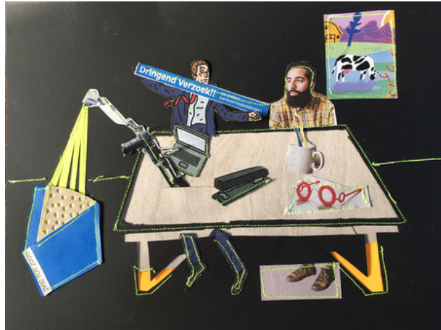
Light on the matter, 2020 mixed media on paper, A3