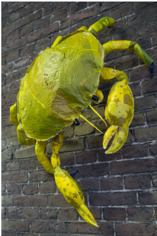
A plastic Crap Crab, Is this the Oceans Future!, 2019 plastic fusion + sewing, 80 x 60 x 15 cm

2019 Winter surprises Website Marie-Josee van het Erven The Hague, Netherlands www.muzeescheveningen.nl item on website