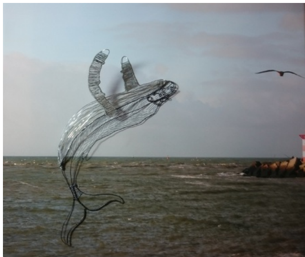
Bultrug Visite, 2018 mixed techniques, 40 x 40 cm