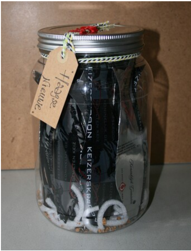
'New Hague herring', 2017 mixed techniques, 24 x 14 x 14 cm