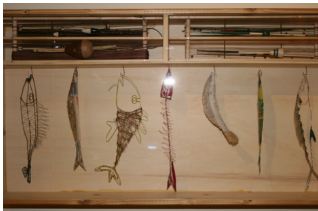
'Daily catch'., 2017 mixed techniques, 70 x 36 x 12 cm