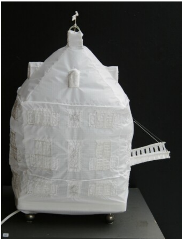
Hofwijck mansion, 2014 embroidery & sewing, 38 x 20 19 cm