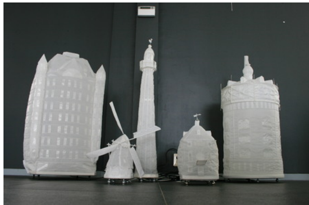
series 'Castles in the Air' embroidery & sewing, 250 x 125 cm