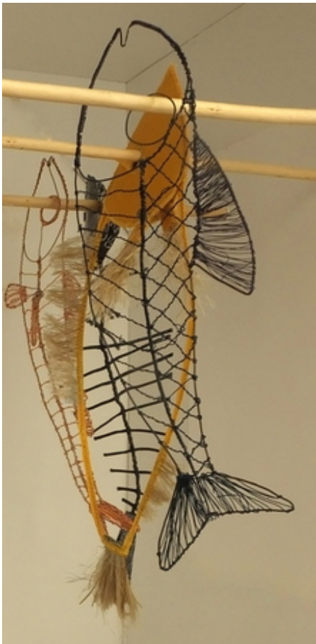
'Spoil secured!'; detail, 2016 mixed techniques, 30 x 30 x 30 cm