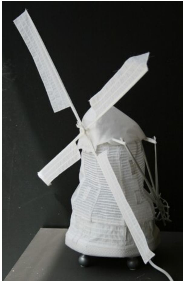
windmill 'The Vlieger', 2014 embroidery & sewing, 46 x 16 x 16 cm