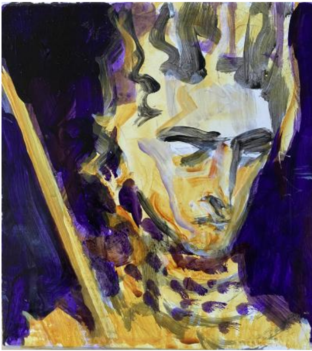
Visionary Heads : Judith