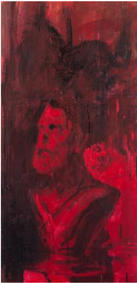
portrait of the philosopher as a Byzantine emperor burning in Hell acrylics, 9010 RAL white & black lacquer