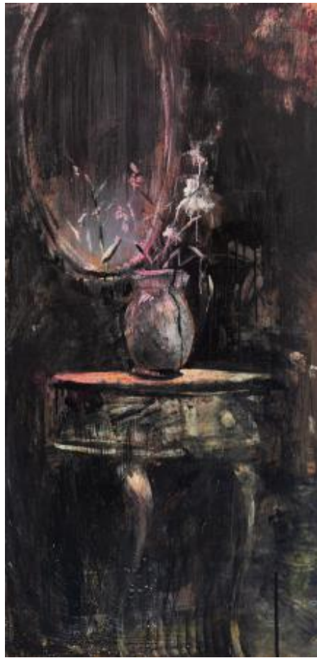
Lick My Crack Acrylics, 9010 RAL white & black lacquer