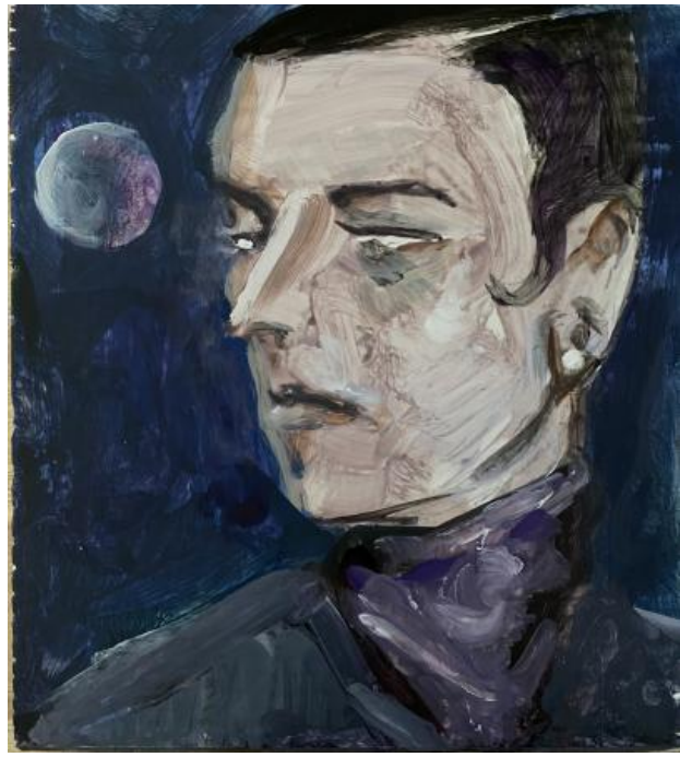
Visionary Heads : Djuna