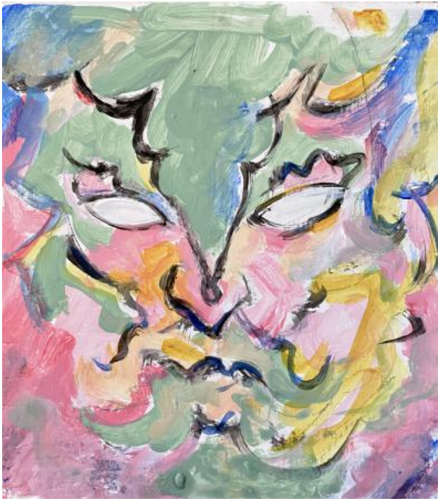
Visionary Heads : Mallarmé