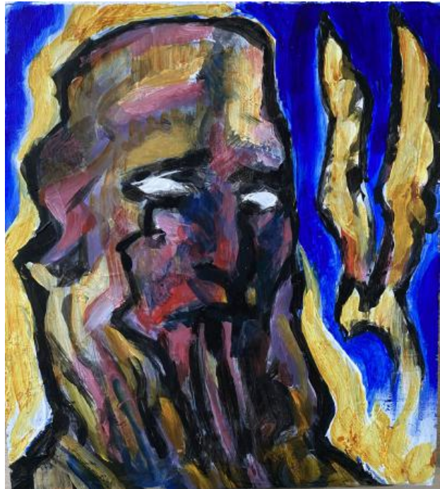
Visionary Heads : Solomon