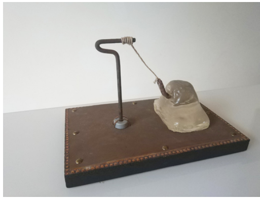
Much of a muchness, 2018 koper, hout, ijzer, touw, kunststof, 25 x 25 x 20