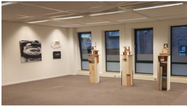
3 objecten, 2021 wood, moving parts, 3x object 150 x 40 x 30