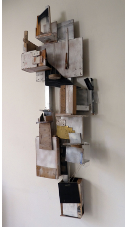
Large construction wall, 2018 wood, iron, plexiglass, rope, 160 x 50 x 25