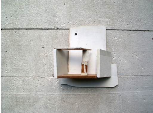
White improvisation, 2019 wood, 25 x 10 x 25