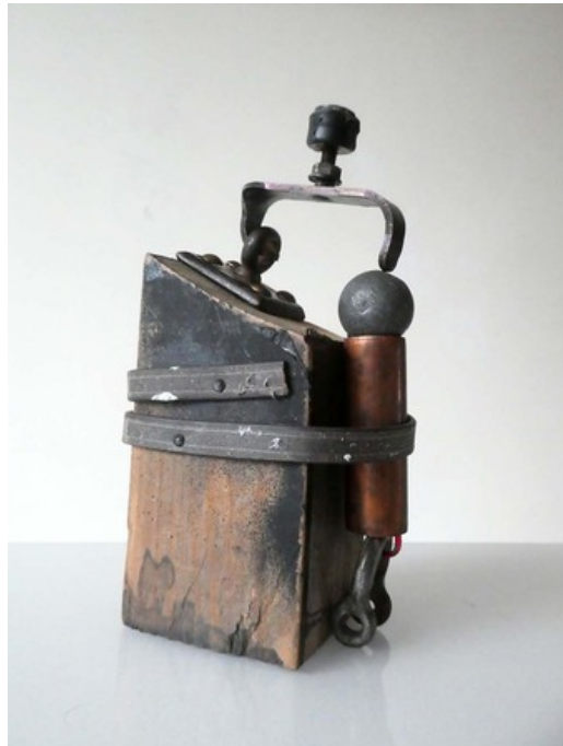
Much of a muchness, 2018 wood, iron, rubber and nails, 10 x 10 x 15