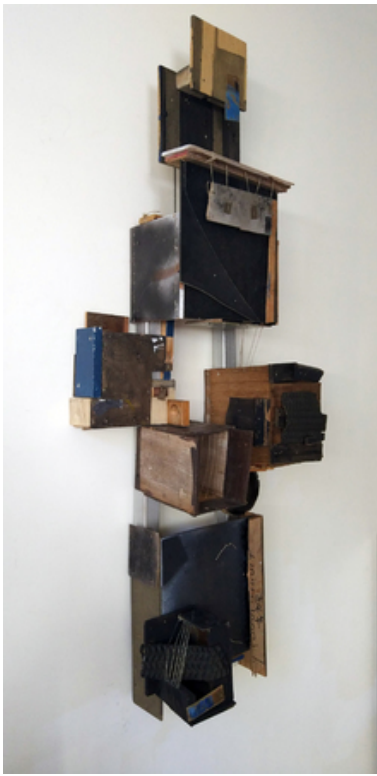
Large construction wall, 2018 wood, iron, plexiglass, rope, 160 x 50 x 25