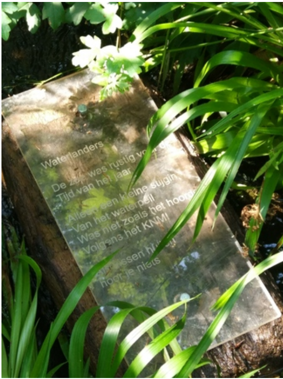
Waterlanders, 2018 wood, plexiglass, printing, 50 x 20 x 20