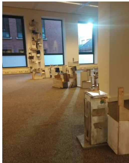
Installation, 2021 wood, rope, paint, plexiglas, zaalvullend