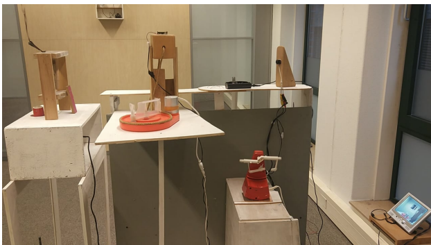
Moving, 2021 0