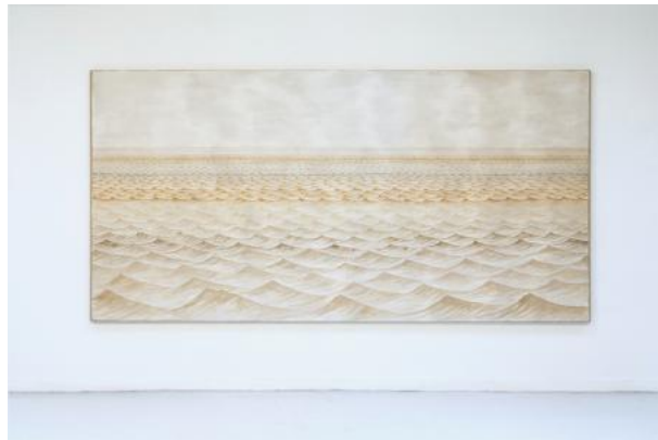
Water, 2022 casein with fossil bone pigments from the North Sea, seawater and gesso on canvas, 300x150 cm.