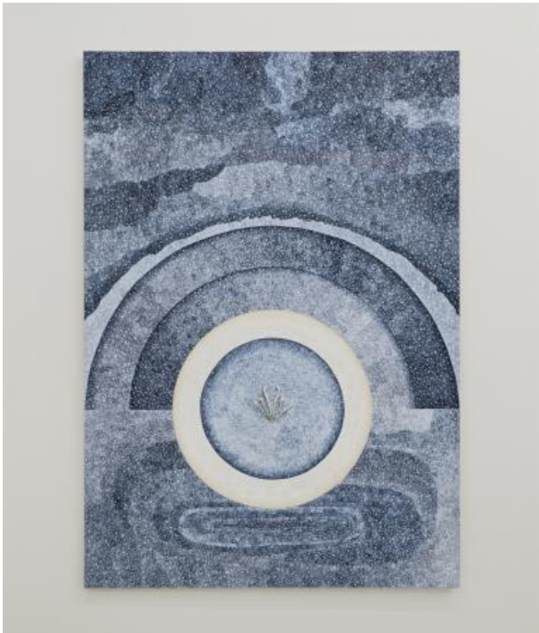
The universe bends around the dying birds, 2024 casein, sea water, whale bone pigment, beaks on canvas, 200x140 cm.