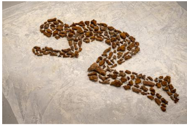
I am the seabed, 2022 gouache with sand pigment and sand with iron and iron oxide from the bottom of the sea, 170x220 cm.