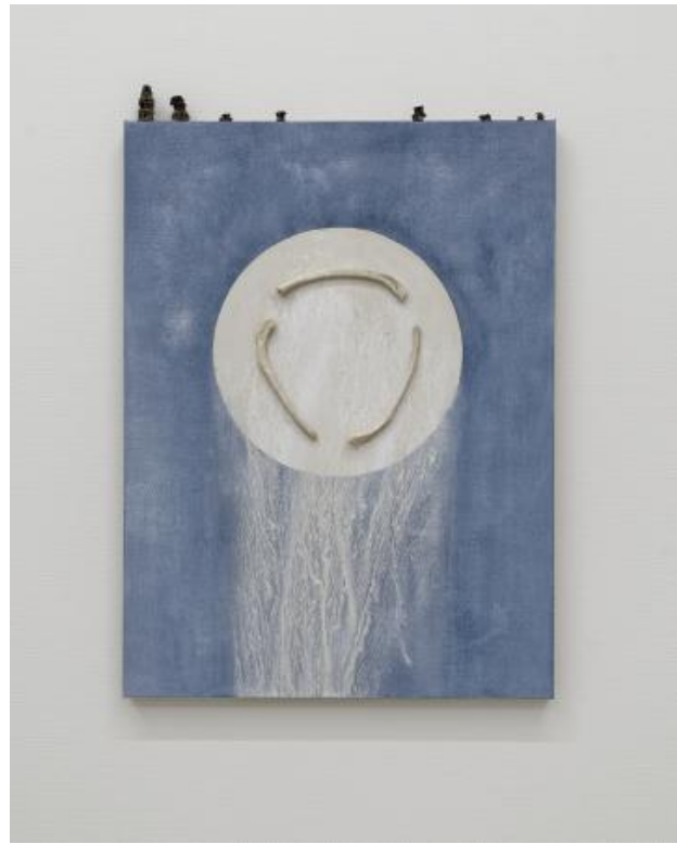
Cycle of a seal, 2024 Wadden Sea water, North Sea sand pigment, casein, engraved seal ribs, fish bones on canvas, 80x60 cm.