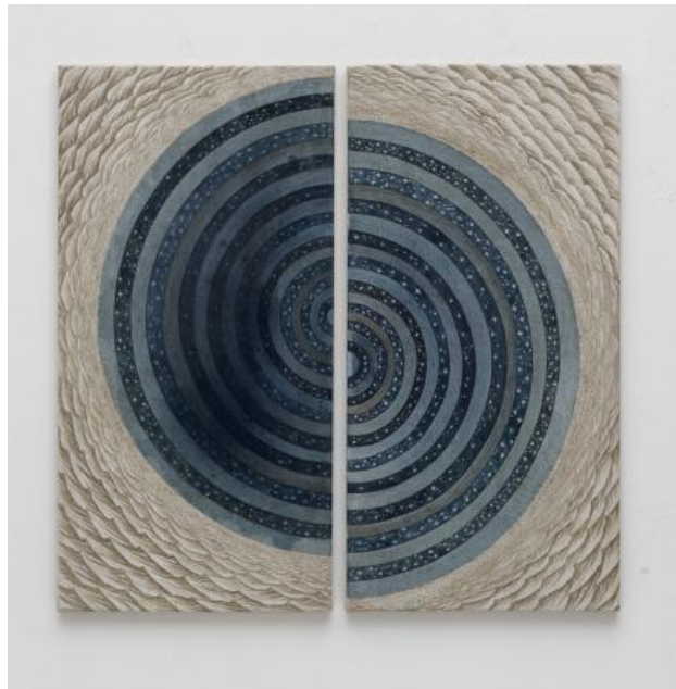
They breached the Wadden dike there, 2023 casein with fish bone pigment, seawater and gesso on canvas, 80x82 cm.