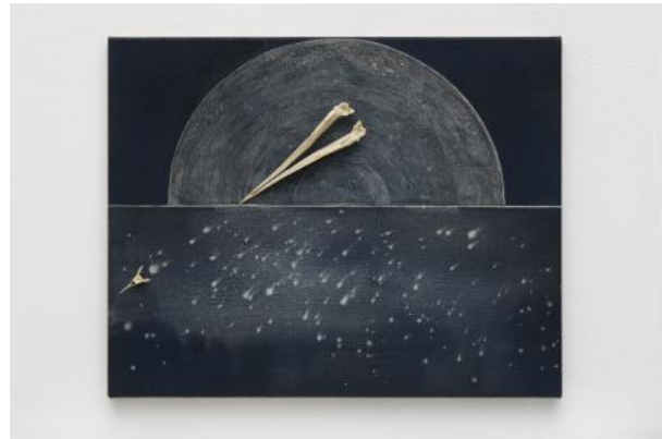
Where the animals go to die (Northern gannet), 2023 casein with pigment of European oyster, seawater, gannets beak, fishbone and gesso on canvas., 40x50 cm.