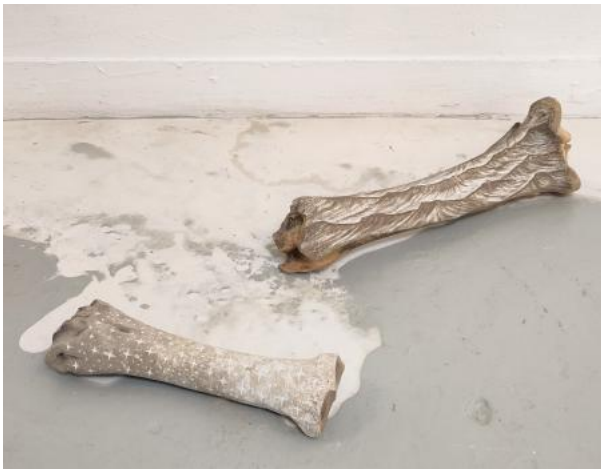
Tideline (detail), 2024 washed up bones, fossil bone pigment casein, North Sea sand pigment