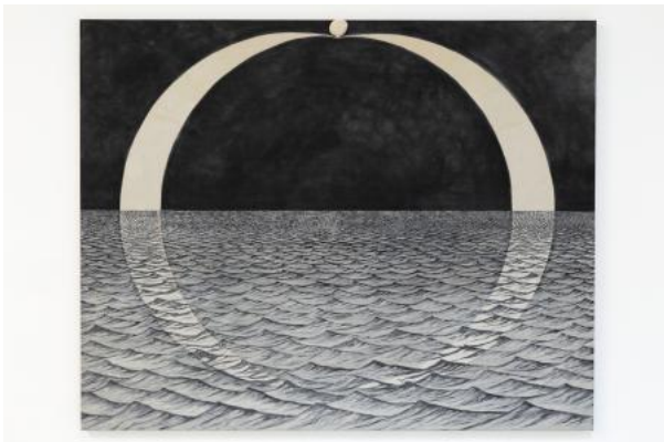
Moon, 2023 casein with cockle and whale bone pigment, seawater, cockle on canvas, 120x150 cm.