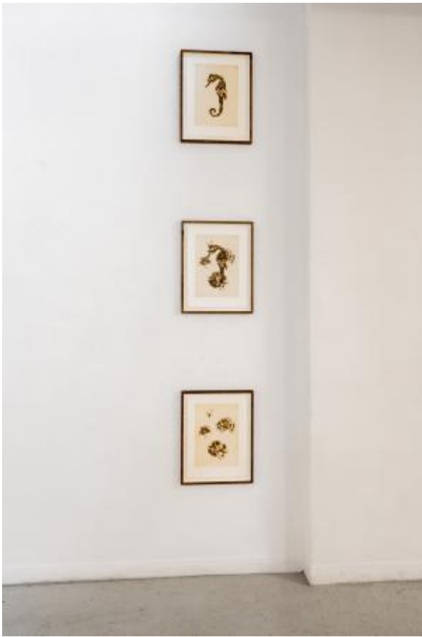
Hippocampus hippocampus, Hippocampus hippocampus and Electra pilosa, Electra pilosa, 2022 photo etchings printed with washed up oil, frames are coloured with the same oil, 34x44 cm.