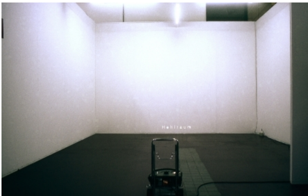
Hohlraum, 2006 diaprojectie