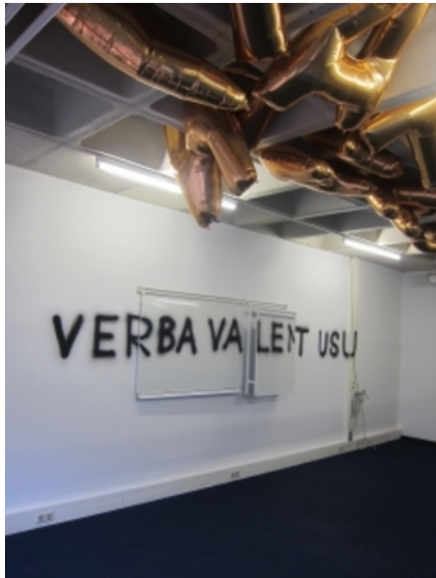
VERBA VALENT USU (I&II), 2016 ballonnen, helium, spray paint, site specific