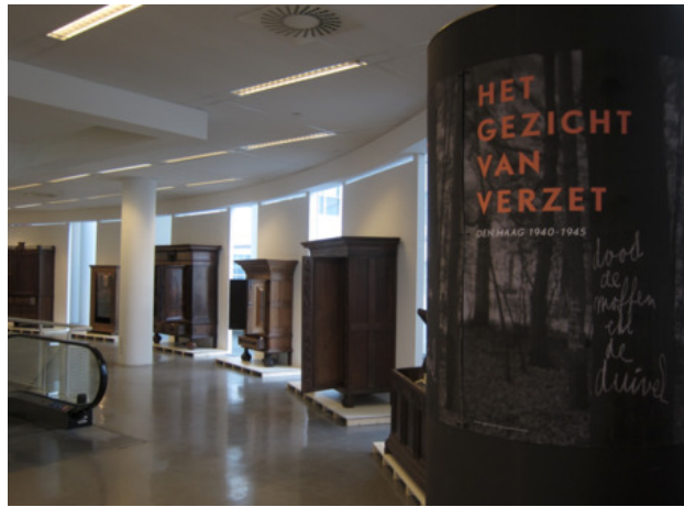
Het gezicht van verzet, 2018 Installation