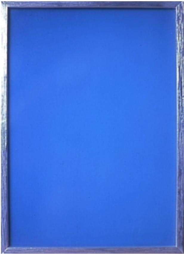
Idiosyncratic, 2019 kleurenfoto, verzilverde lijst, 18,2 x 13,2 cm