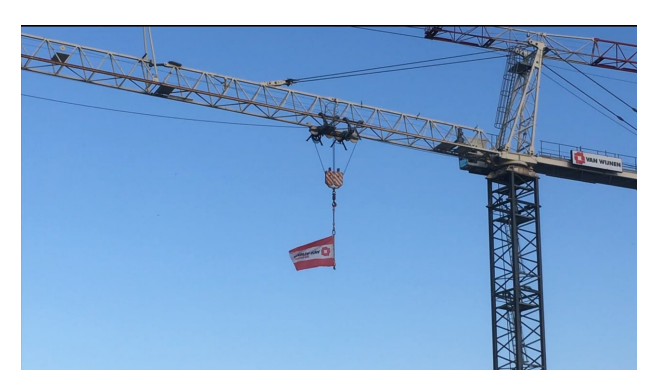
Untitled (Study with Flag), 2017 0'39"