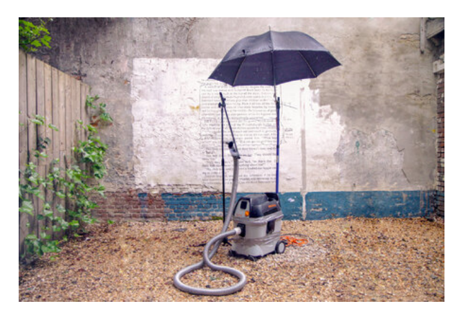
Untitled (sculpture with vacuum cleaner), 2012 Installation. Vacuum cleaner, umbrella,