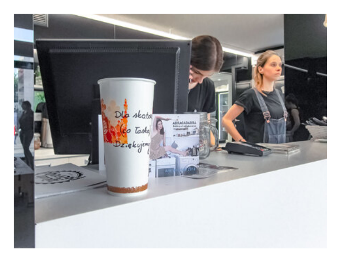
Spectrum, 2016 Performative installation, Burger King paper cup, mar