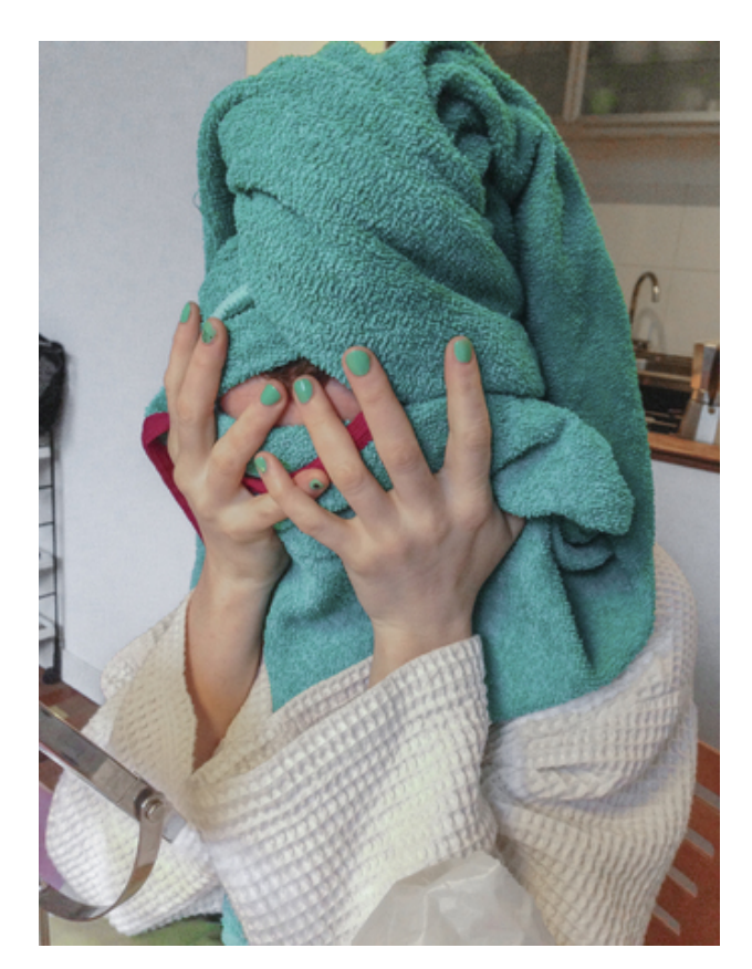
Untitled (portrait study), 2014 Digital photography