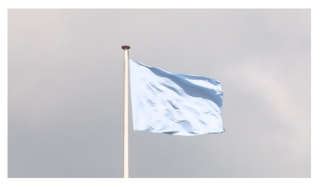
Untitled (Flag #2), 2011 23'