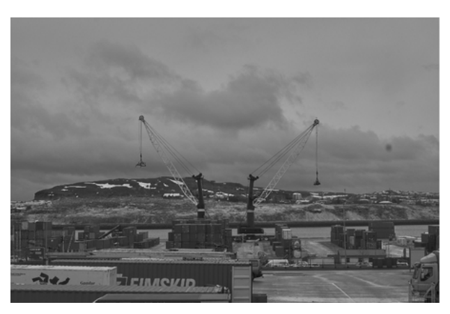
Untitled (R.S.), 2015 Digital photography, image editing, software, variable