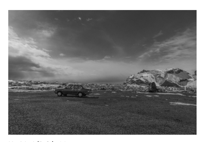
Untitled (R.S.), 2015 Digital photography, image editing, software, variable