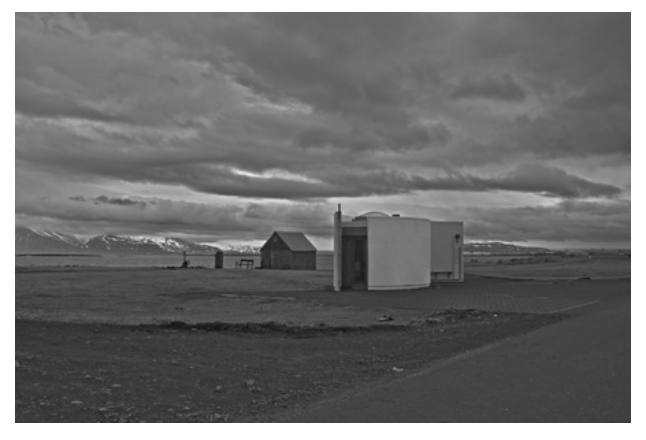
Untitled (R.S.), 2015 Digital photography, image editing, software, variable