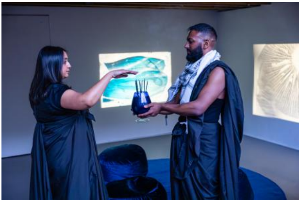
Welcome/Opening ritual Grantangi Plant Medicine, 2024 Ritual with selfmade incense