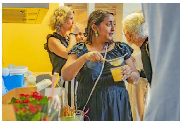
The Holy Color of Turmeric, the sunlit spice, 2024 fresh apple, turmeric, ginger, and lemon juice