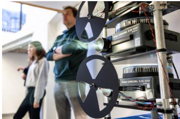
Grantangi Plant Medicine, 2024 Film installation