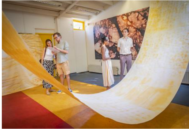
The Holy Color of Turmeric, the sunlit spice, 2024 Kurkuma sunlight anthotype prints on paper and textile

2004 2019 2e bij The Oneminutes Awards van het Sandberg Instituut Amsterdam.