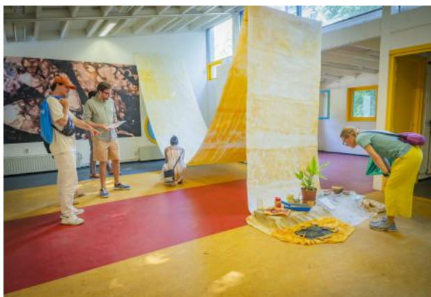
The Holy Color of Turmeric, the sunlit spice, 2024 Kurkuma sunlight anthotype prints on paper and textile