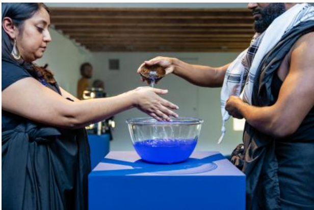
Welcome/Opening ritual Grantangi Plant Medicine, 2024 Ritual with selfmade incense