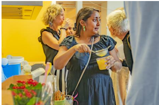
The Holy Color of Turmeric, the sunlit spice, 2024 fresh apple, turmeric, ginger, and lemon juice