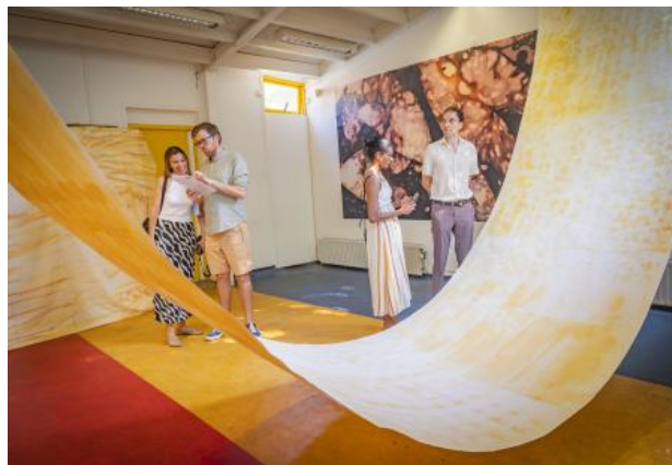
The Holy Color of Turmeric, the sunlit spice, 2024 Kurkuma sunlight anthotype prints on paper and textile

2004 2019 2e bij The Oneminutes Awards van het Sandberg Instituut Amsterdam.