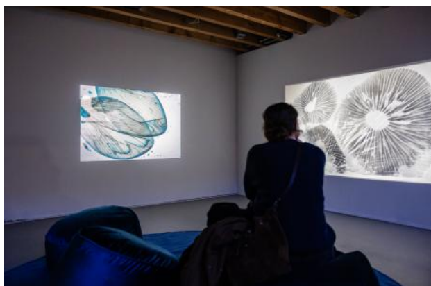
2019, 2024 Film installation