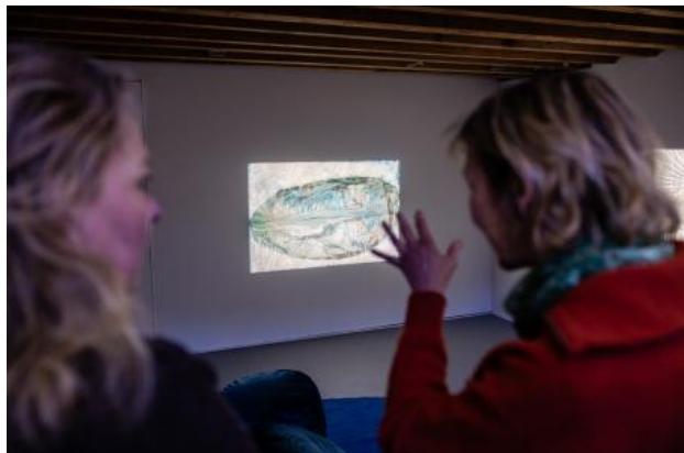
Thank You Plant Medicine, 2024