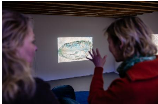
Thank You Plant Medicine, 2024