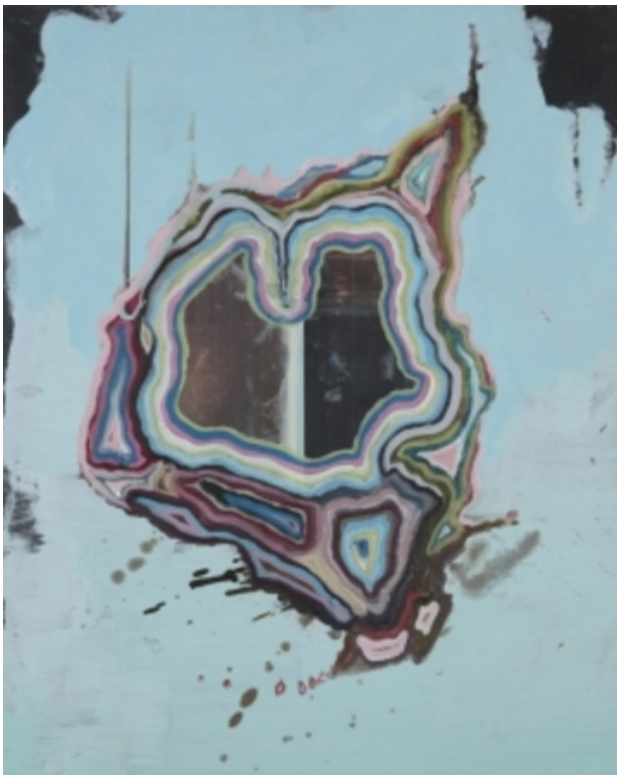
Psyche, 2013 olieverf op paneel, 50 x 40 cm