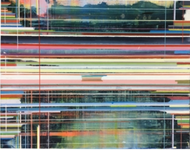
Defect, 2016 acryl & olieverf op paneel, 130 x 140 cm

2006 - Docentschap, Willem de Kooning 2007 academy, Rotterdam