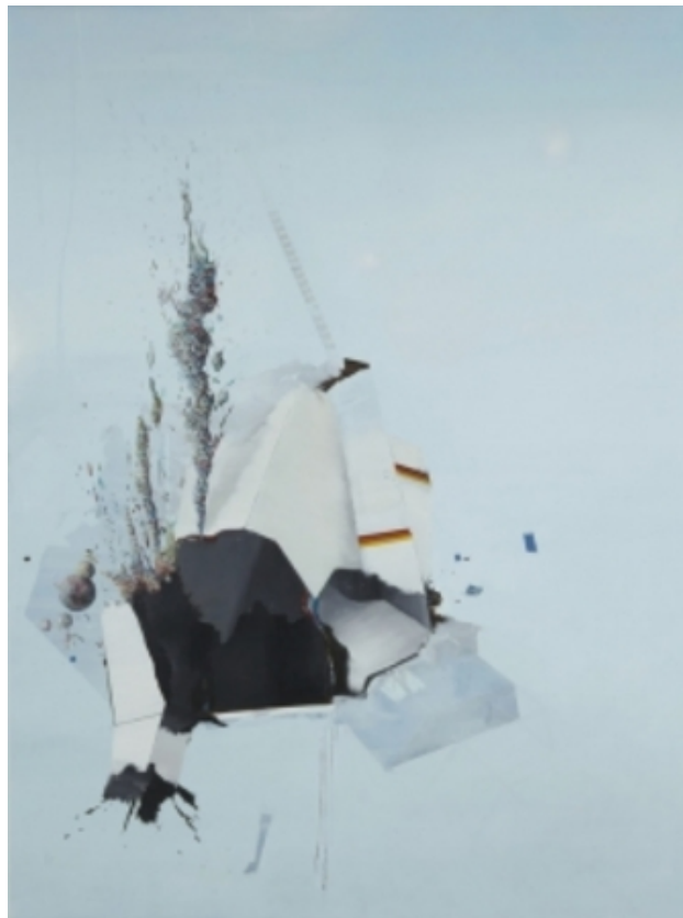
Under Pressure, 2013 olieverf op doek, 190 x 140 cm