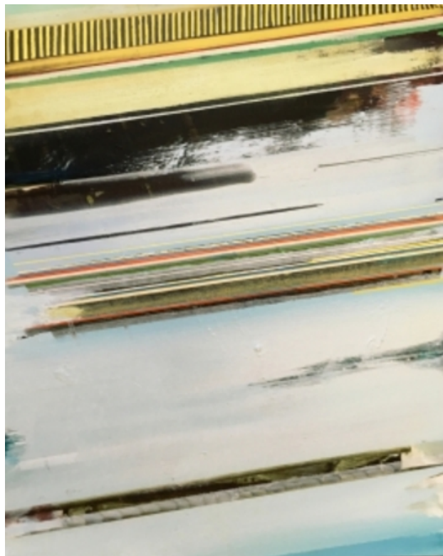
Shorewall, 2016 acryl & olieverf op paneel, 120 x 100 cm