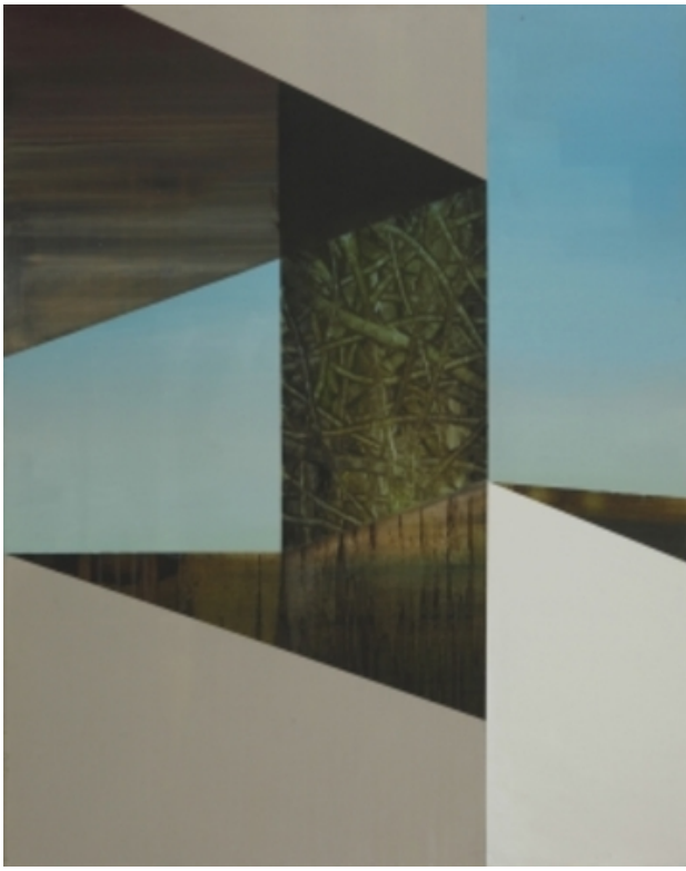
Terranean, 2012 acryl & olieverf, 100 x 80 cm