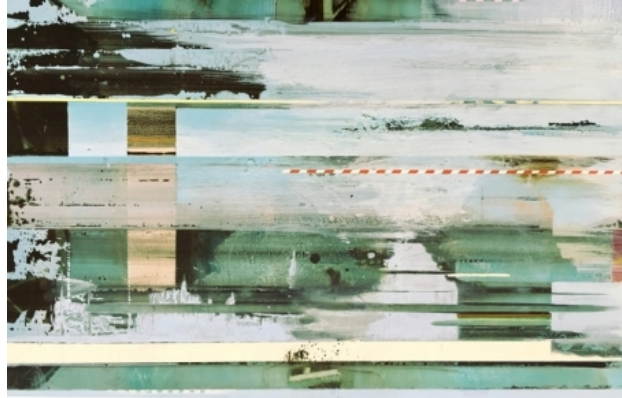
Config_block, 2016 acryl & olieverf op paneel, 140 x 160 cm