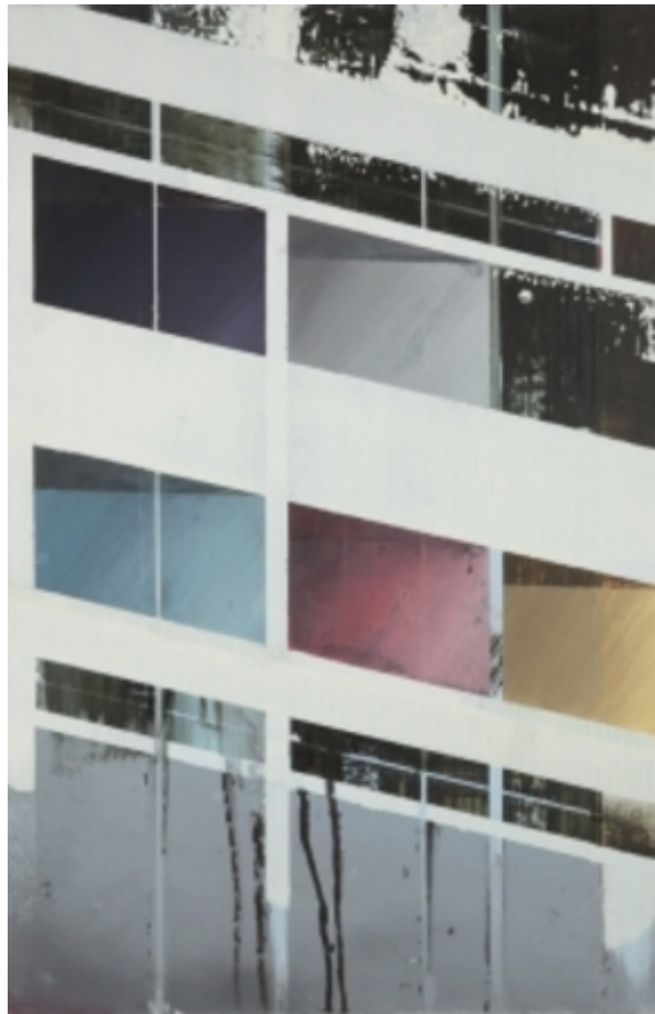
Unité, 2013 olieverf op paneel, 61 x 40 cm