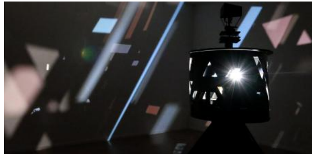
Incidence of Light, 2019 light, sound, movement, 80x80x150