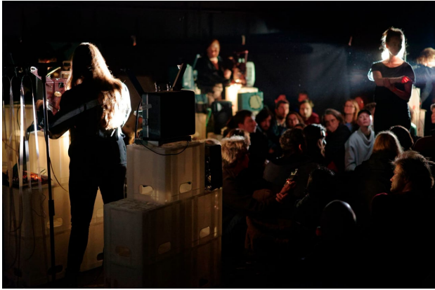
Optical Sound Orchestra, 2017