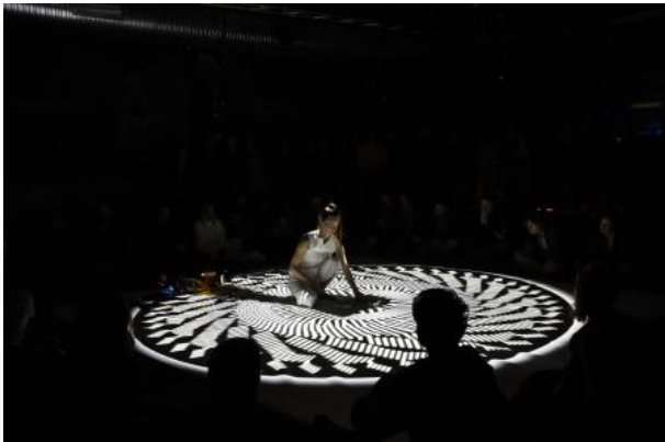
Stirred Mandala, 2019 light to sound