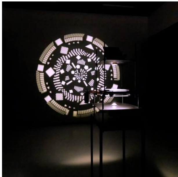
Hidden Patterns, 2022 light, sound