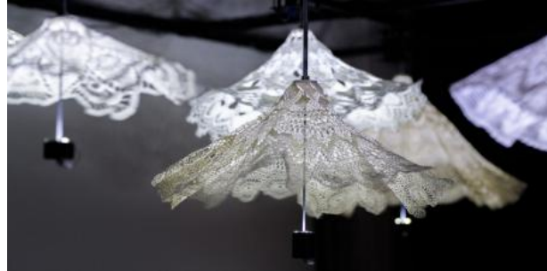
Crochet, 2020 licht en beweging, 3m x3m