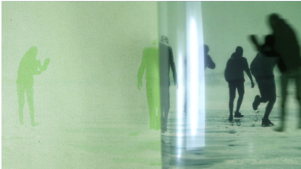
a stone has to breathe, 2021 3:57