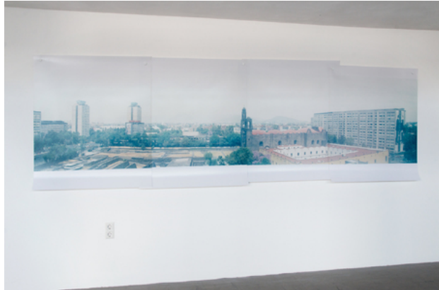
Panorama of Plaza de las Tres Culturas (Tlatelolco), Mexico City, 2018 4 analogue colour photog, 120 x 400 cm.