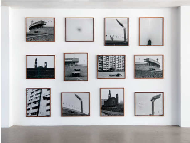
Olympic Stadium (outside) and Plaza de las Tres Culturas (Tlatelolco), Mexico City, 2018 12 analogue b&w photographs (framed), each: 50 x 60 cm.