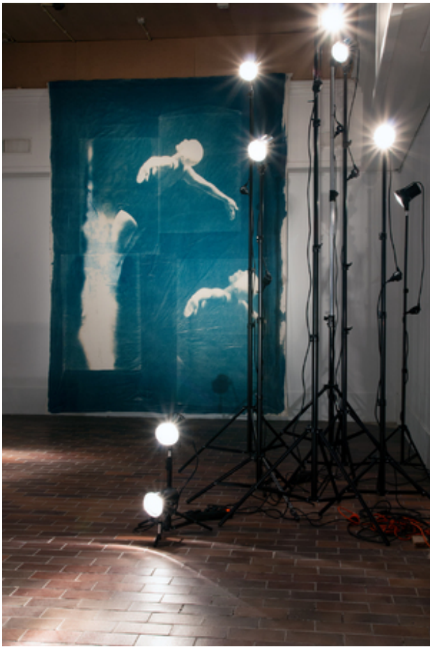
Diver, 2018 cyanotype, 360 x 240 cm.