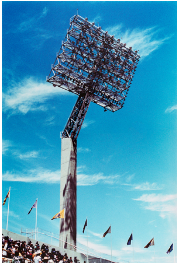
Olympic Stadium (inside), Mexico City, 2018 analogue colour photograph (cross developed negative), 120 x 80 cm.