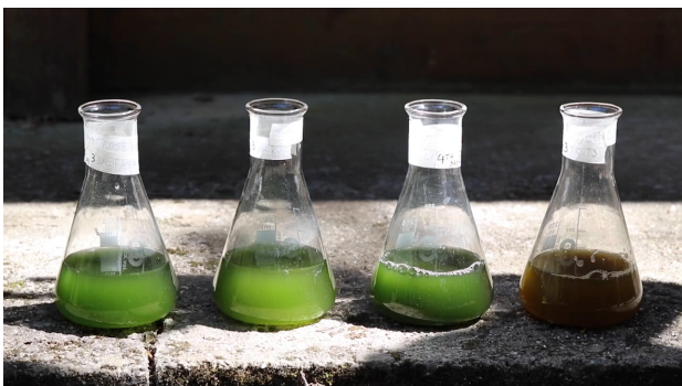
Final Sharing Event Advanced Master of Research in Art & Design, September 2020, 2020 15:58