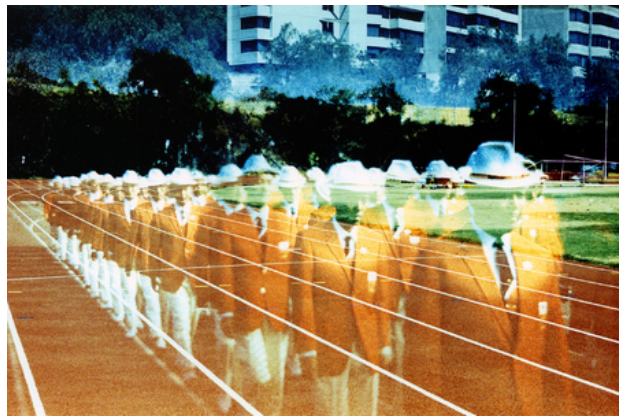
Marching 1968/2018, 2018 analogue double exposure (cross developed negative), 80 x 120 cm.