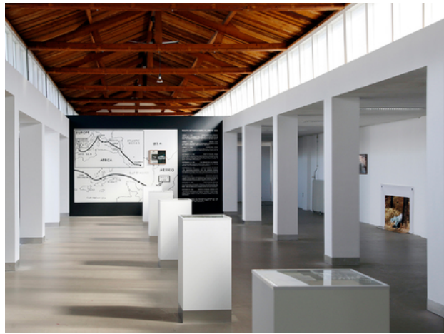
Social Dissolution of the West, 2018 Installation