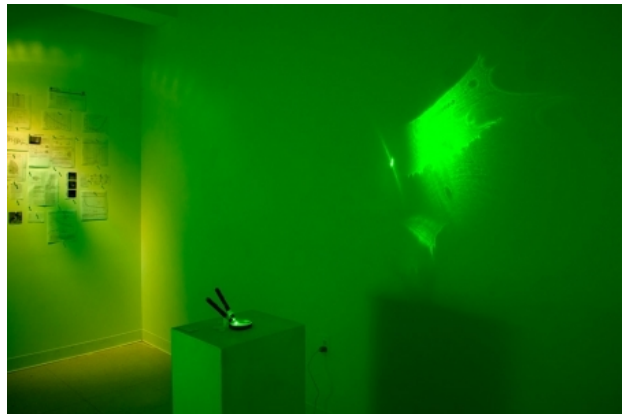
microscope Chamber #1, 2013 photo documentation of the installation