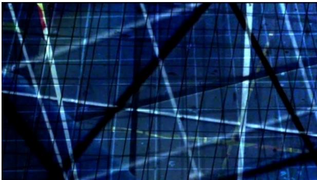
Grids, 2012 hd video