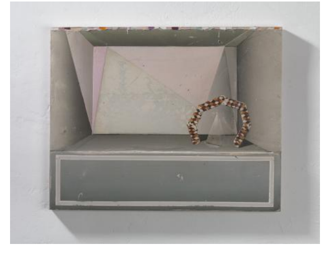
Untitled , 2023 Mixed Media / Acrylics on panel, 38,5 x 48,5 cm