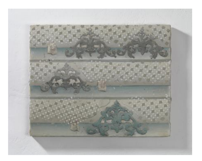
Untitled, 2023 Mixed Media / Acrylics on panel, 37 x 46,5 cm