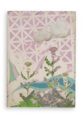
Untitled, 2021 Mixed Media / Acrylics on panel, 28 \times 20 \text{ cm} \times 2