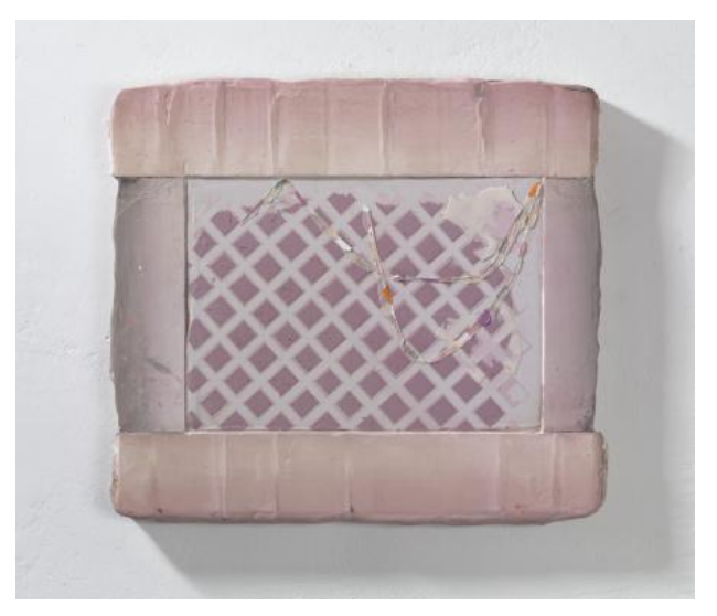
Untitled, 2023 Mixed Media / Acrylics on panel, 35 x 39 cm