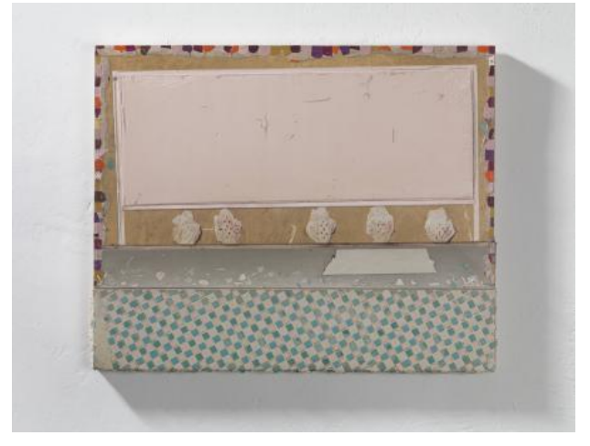
Untitled (rouge), 2023 Mixed Media / Acrylics on panel, 39,5 x 48,5 cm

- Galerie Jochen Hempel Leipzig, Germany <u>www.jochenhempel.com</u>