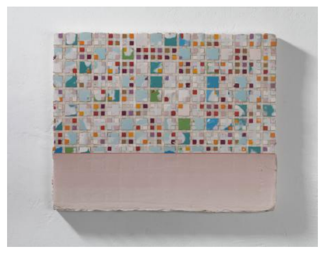
Untitled, 2023 Mixed Media / Acrylics on panel, 39 x 39 cm