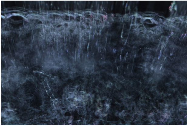
Loss of Unity , 2020