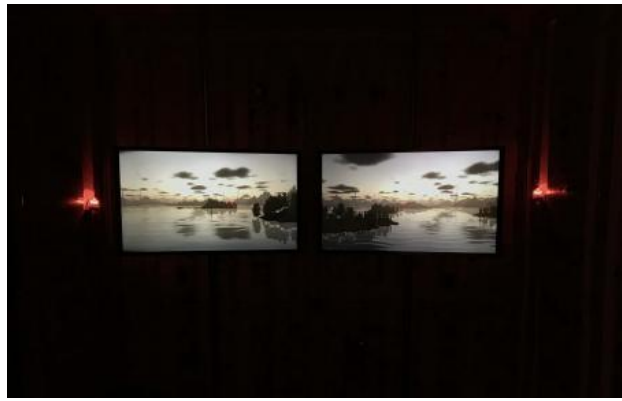
Flowing Grounds | Stockholm, 2022 Installation - 2 channel video, multichannel audio, tactile transducers, signal lights