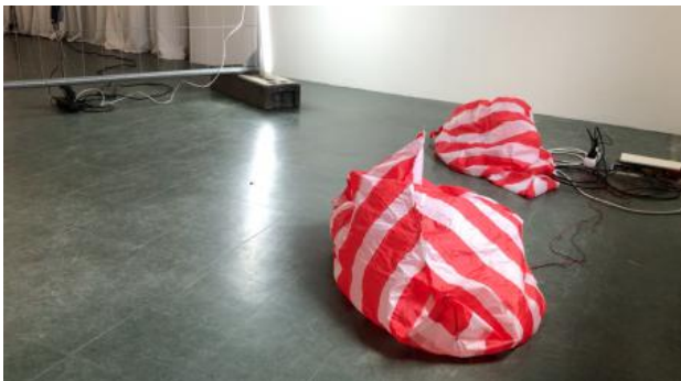
Symbiotic Spaces | Stockholm, 2021