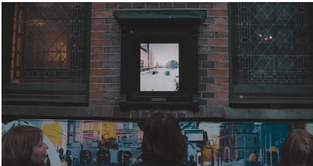
Vec4(red,green,blue,alpha), 2024 02.56