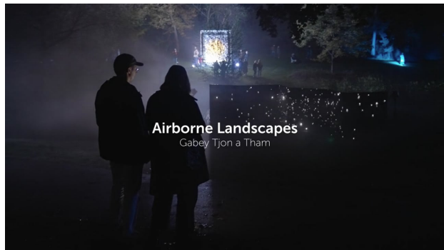
Airborne Landscapes, 2022 02:14