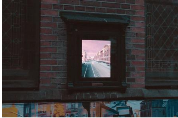
Vec4(red,green,blue,alpha), 2024 Generatieve virtuele 3D omgeving op scherm, 41 x 33 x 4 cm

2017 - Panel discussion - Urban Books #48 Leven 2017 in Media , Pakhuis de Zwijger, Amsterdam