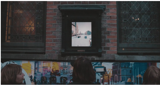
Vec4(red,green,blue,alpha), 2024 02.56