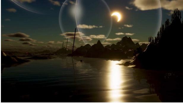
Flowing Grounds | Stockholm, 2022 01:48