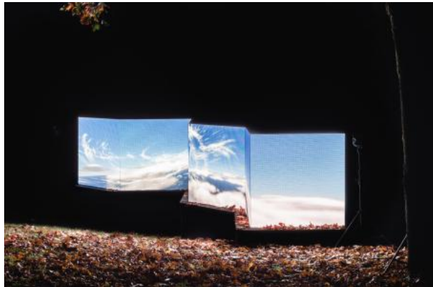
Airborne Landscapes, 2022