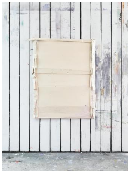
Crushed Box (creme) , 2023 cardboard, resin, pigments, paint, bolts, 150x90x5cm