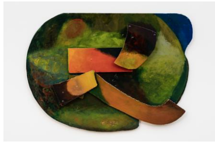
2B Van Gogh and then Murray , 2023 cardboard, resin, paints, pigments, bolts , 190x110x10cm