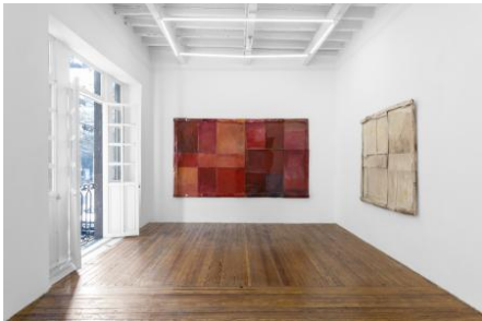
The Good, The Bad and the Ugly , 2025