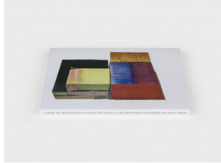
Full of Emptiness , 2021 192 PP / 213 × 297 MM / 400 COPIES / ENGLISH ISBN: 978-1-7345275-6-8, 213 × 297 MM