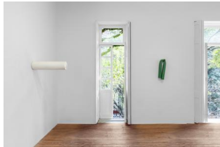
The Good, the Bad and The Ugly , 2025