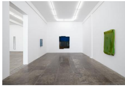
Bijna Niks , 2023