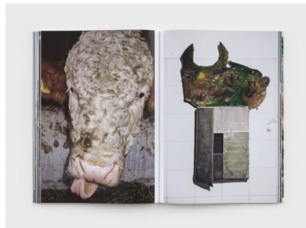
Full of Emptiness , 2021 192 PP / 213 × 297 MM / 400 COPIES / ENGLISH ISBN: 978-1-7345275-6-8, 213 × 297 MM