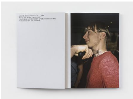
Full of Emptiness , 2021 192 PP / 213 × 297 MM / 400 COPIES / ENGLISH ISBN: 978-1-7345275-6-8, 213 × 297 MM