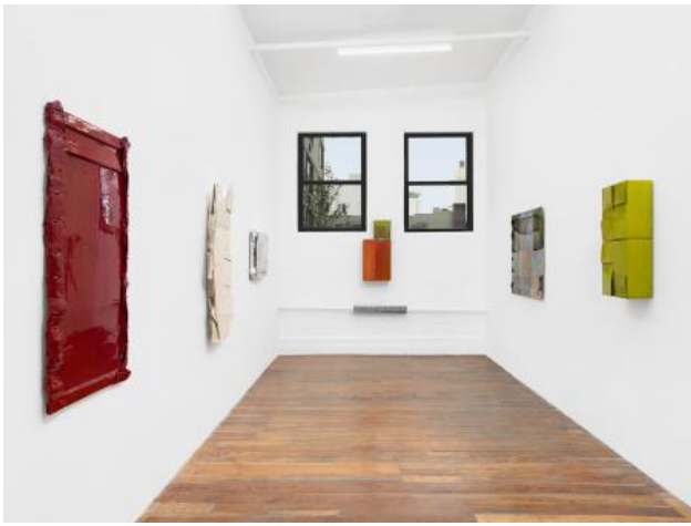
Boxing Glove, 2023