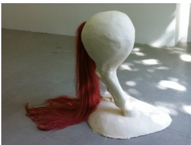
Main functions of a toy horse #3, 2012 Sculptuur, 140 cm