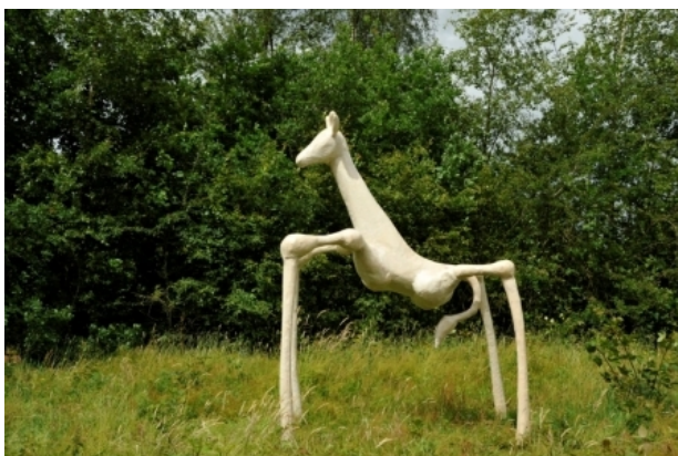
Giraffe, 2009 sculptuur, 290