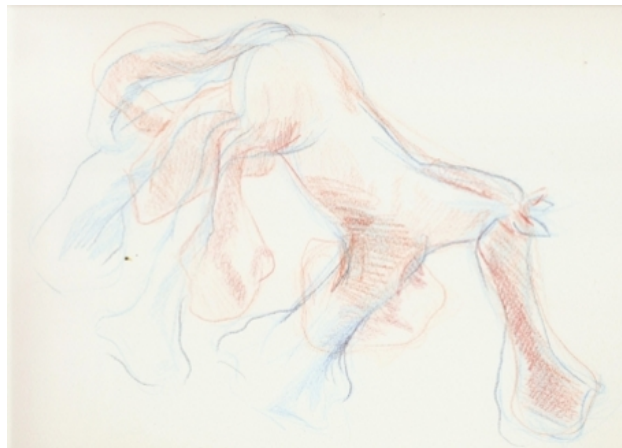
Almost a Horse, 2013 stereoscopische tekening, 30 x 40 cm