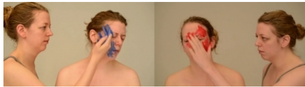
My Favourite Colour, 2015 video