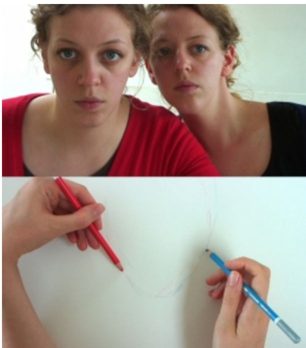
Red and Blue, Me and You, 2012 Video