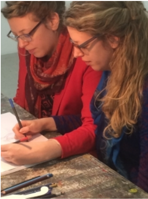
tweelingtekenen, 2016 potlood, papier, objecten