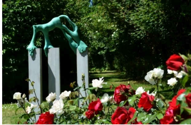
Malfunction of a Toy horse, 2015 Sculpture, 160