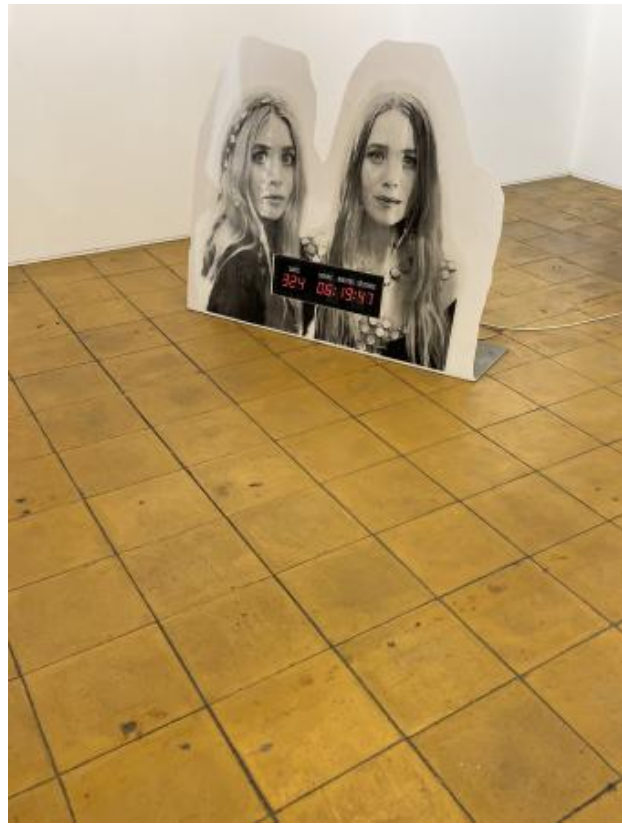
new me me , 2023