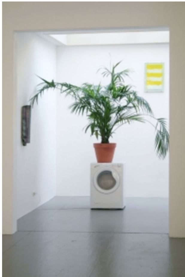
Oh?!, 2014 was machine met plant, variabel