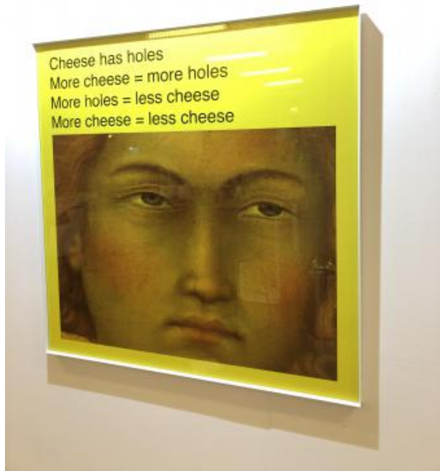
cheese, 2020 ingelijste foto met geel plexiglas, 100 x 100 cm