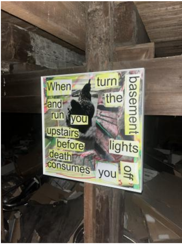
basements lights, 2024