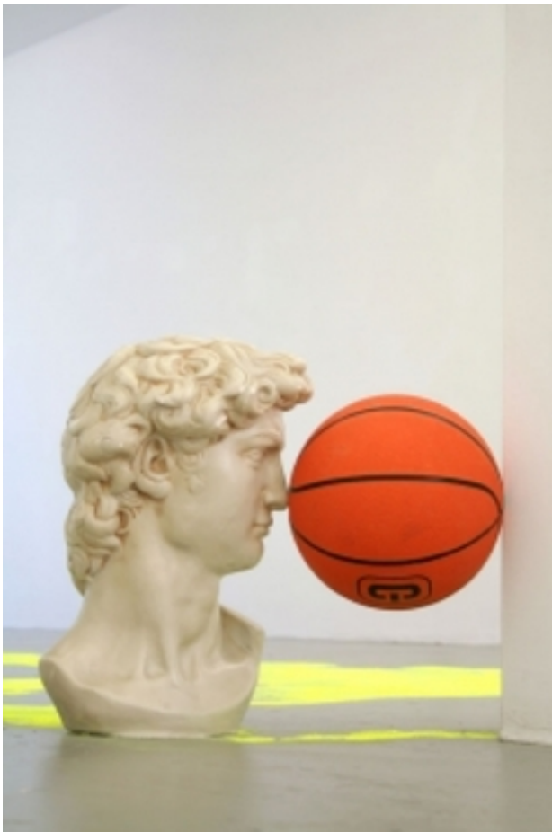
All Surface, 2014 David sculptuur met basketbal