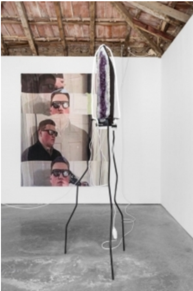
untitled & U, 2017 Sculpture with neon and amethyst & beach