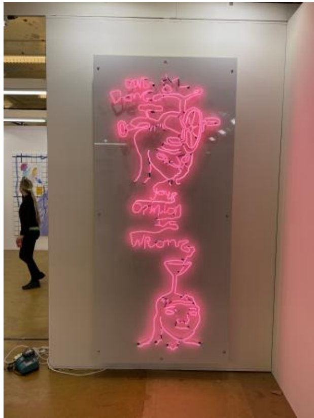
ding dong your opinion is wrong, 2021