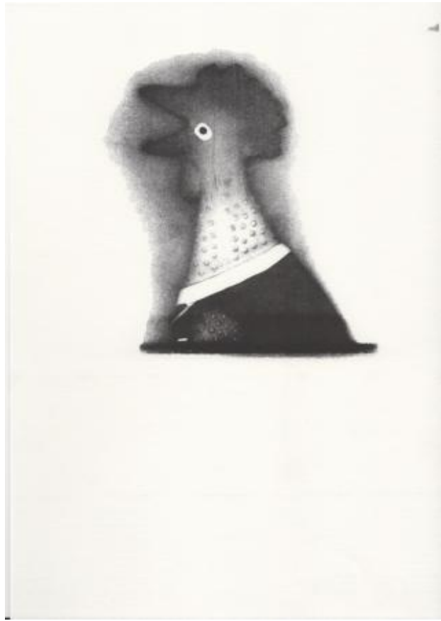
Chicken Referee Sinks in Hole, 2021 riso print, 29,7 x 21 cm