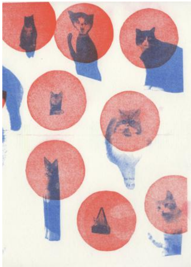
Cats that have appeared in magazines, 2021 riso print, 14,8 x 21 cm