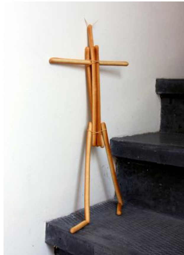
Oh Henry!, 2021 bread sticks, rubber bands, 3 x 30 x 40 cm