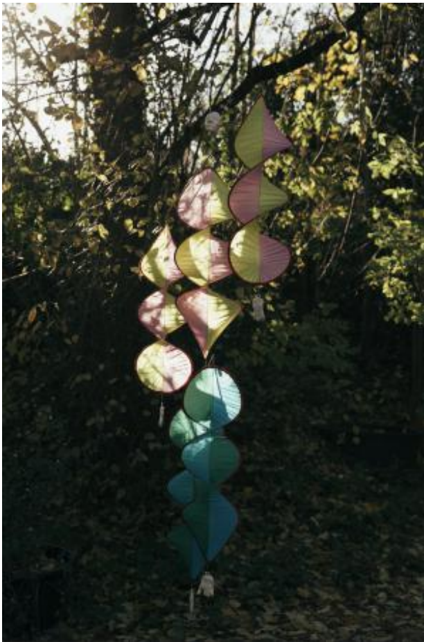
Scare Crows, 2021 textiles, metal, clay, 40 x 80 x 200 cm