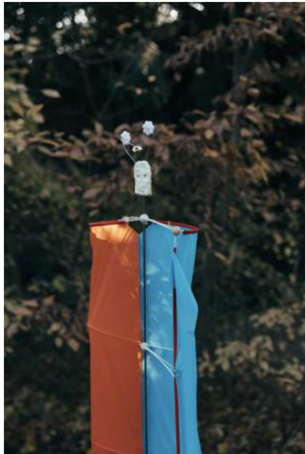
Scare Crow, 2021 textile, metal, clay, wood, 40 x 70 x 140 cm