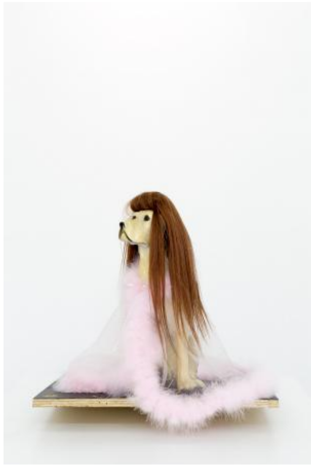
Suzie, formerly known as Guus, 2019 ceramic, human hair, feathers and tulle, 50 x 50 x 50 cm