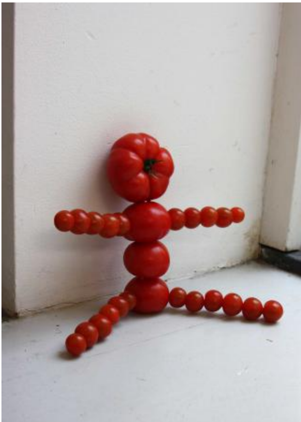
Oh Henry!, 2021 various tomatoes and skewers, 40x40x30 cm