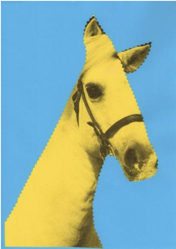
Horse, 2021 collage, 29,7 x 21 cm