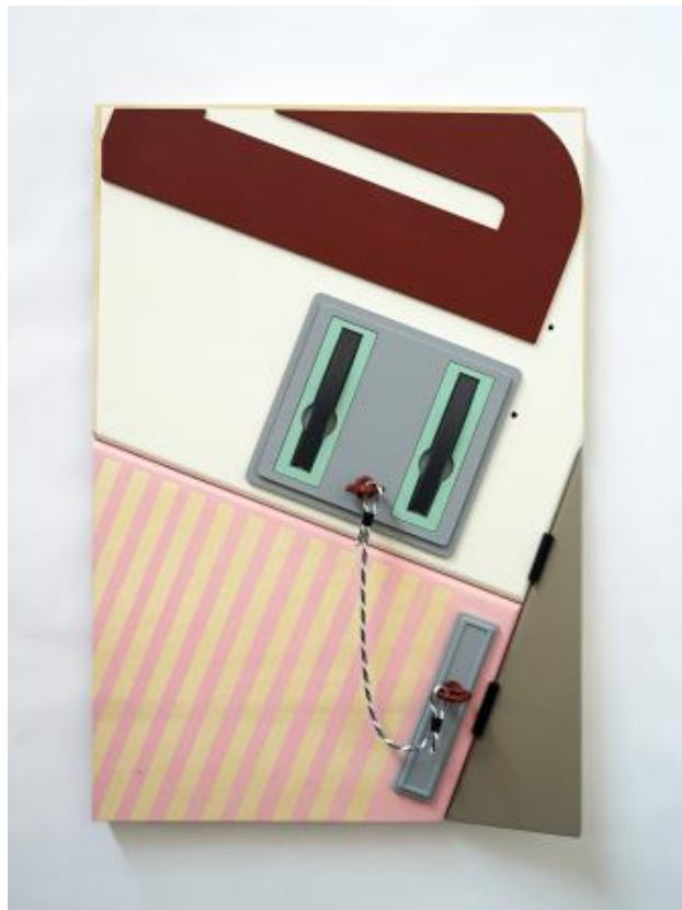
Sotto il D.I.S., 2022 Wandpaneel, 7 x 51 x 75