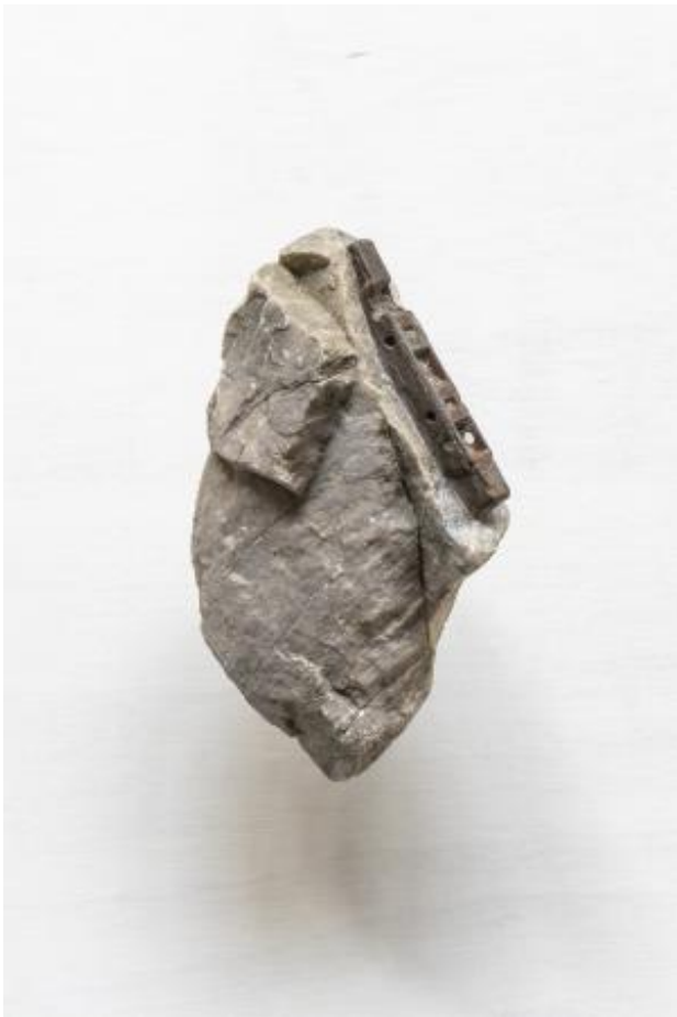
Ci 26 (Civilite), 2024 Sculpture, 20cm x 12cm x 15cm