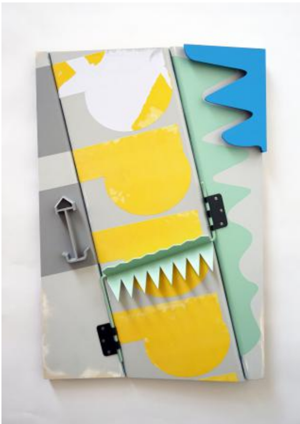
Hinter dem Platz, 2022 Wall sculpture, 17 x 51 x 75