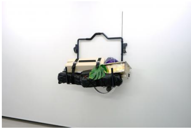
Memorism 2 , 2022 Sculpture, 40 x 101 x 114 cm