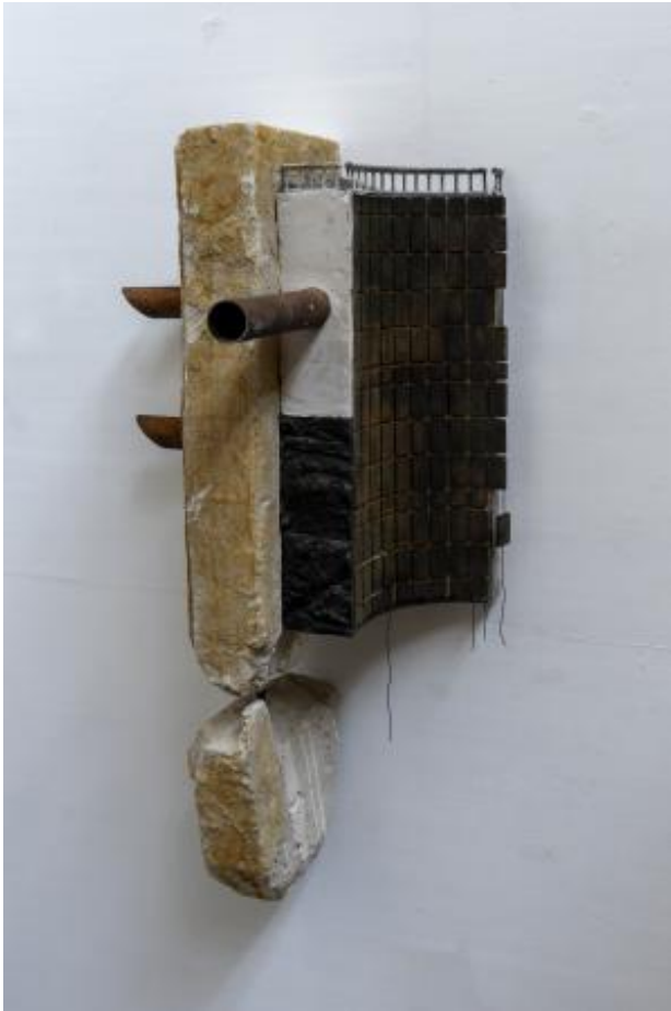
Memorism 4, 2024 Sculpture, 100cm x 46cm x 39cm