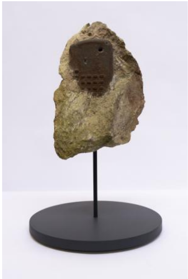
Ci 11 (Civilite), 2023 Sculpture, 32cm x 20cm x 20cm