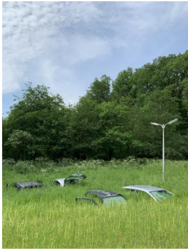
P, 2024 Installation, 800 x 2000 x 380 cm