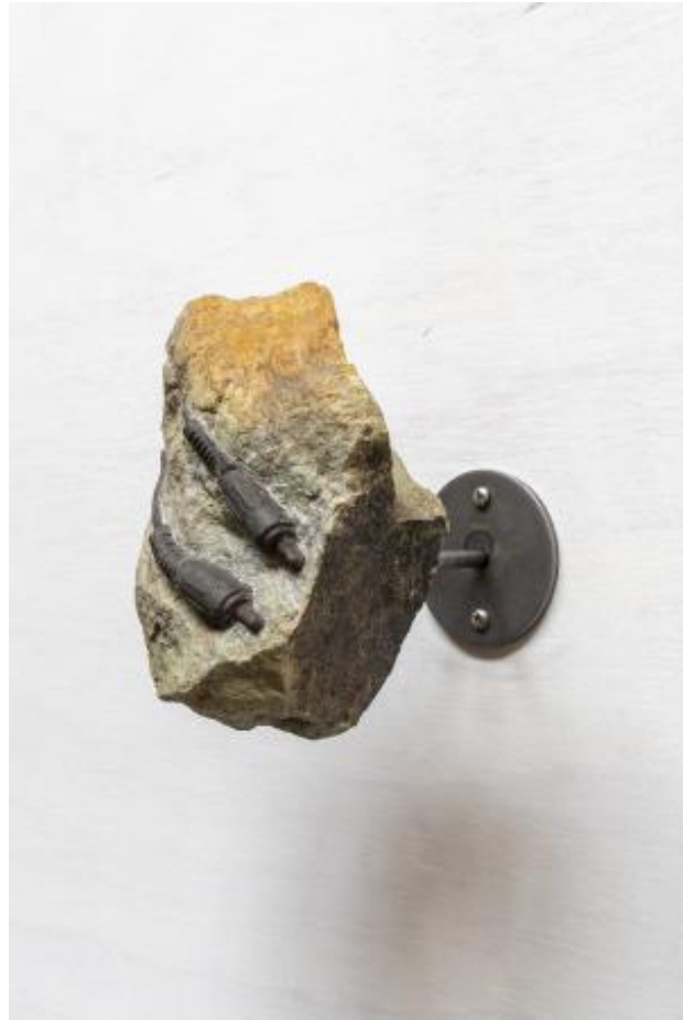
Ci 08 (Civillite), 2024 Sculpture, 13cm x 11cm x 13cm