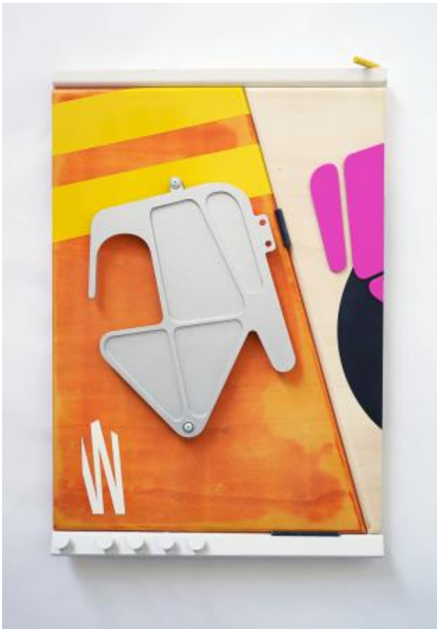
In Orbit, 2022 Wall sculpture, 9 x 51 x 75 cm