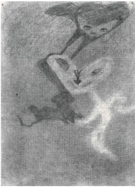
Geen titel Graphite on paper, 15x11