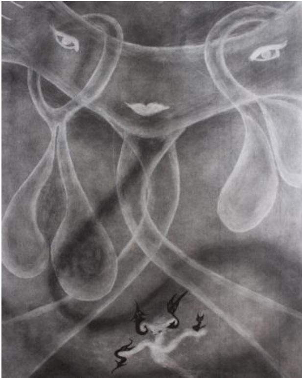
Sheila, 2021 Graphite on paper , 42x60