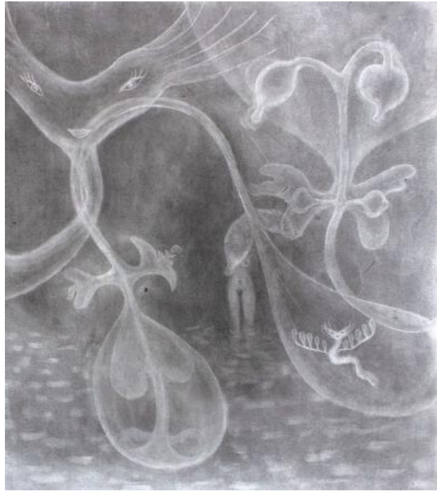
Amazonian Bath, 2021 Graphite on paper , 40x43