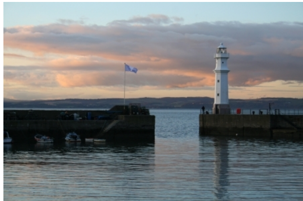
Caller Ou, 2012 Site Specific Flag, N/A