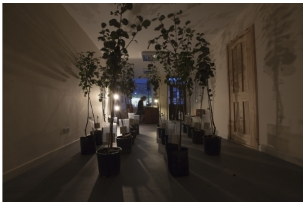
The Galloway Pippin Project, 2014 Installation/Community Project, N/A