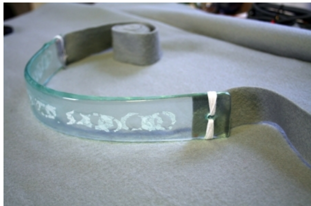
Herring Strap I, 2012 Glass, N/A