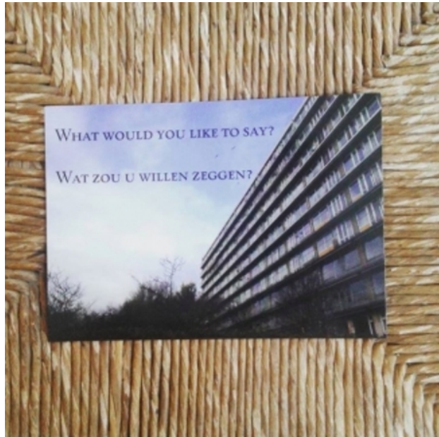
Wat zou u wilen zeggen?, 2015 Postcard/community project, N/A