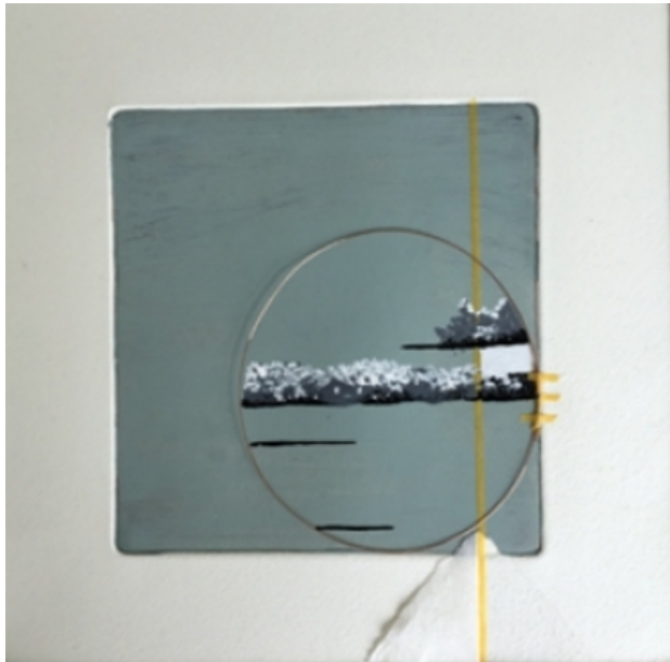
Site revisited 3, 2017 collage, 20x 20