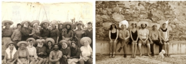
Archivo Ahora Day 21, 2012 Photograph, N/A