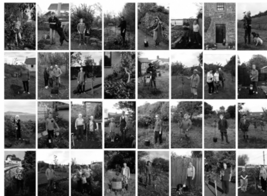
The Galloway Pippin Project, 2014 Photograph, N/A