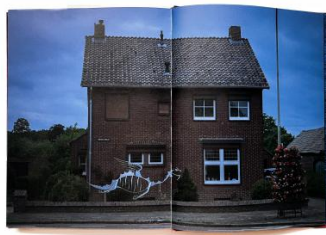
Drakeblood / blood of the dragon - photobook, 2023 Offset printing - 188 pages of interior content + 2x 4 pages of glued endpapers in HARDCOVER., 170 x 240 mm