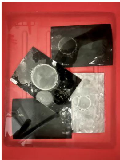
Sketch detail in darkroom , 2024 Analogue photogram, n.t.b.