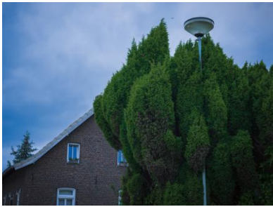
Beekstraat, Beesel, 2023 C print Hahnemuhle photo rag metallic, 60 x 80 x 5 cm