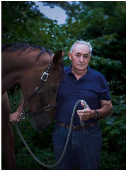
Jo, Saint George 1967, Drakeblood, 2023 C print Hahnemuhle photo rag metallic, 60 x 80 x 5 cm