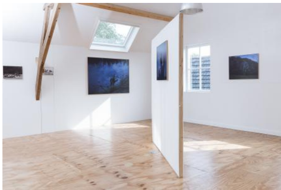
Overview installation exhibition Galerie Brandstof, 2022 Various technics , Various formats

Drakeblood / blood of the dragon - photobook, 2023 Offset printing - 188 pages of interior content + 2x 4 pages of glued endpapers in HARDCOVER., 170 x 240 mm