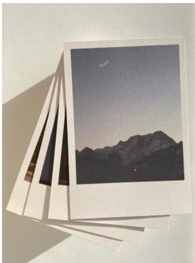
Set 1 project Cuntsmoons 2008-ongoing, 2021 HV Offset fullcolour, 350 gr/m2 edition: 50, 110x160mm