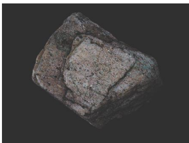
'Dragonblood, dragonstone, 2019', 2019 C-print, various