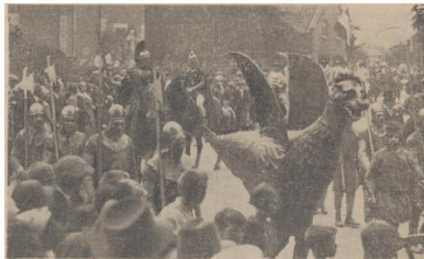
draak lam tam, 1935, 2023 reproduction, 21 x 16 cm