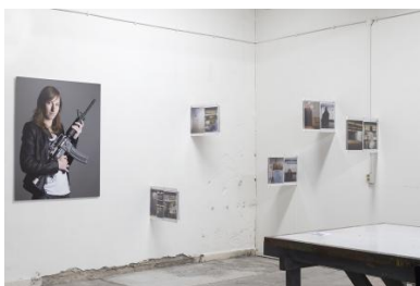
'Exhibition Hoogtij # 48, "It takes my mind off things", A gallery named Sue, The Hague 2017", 2017 Different media techniques , Various sizes