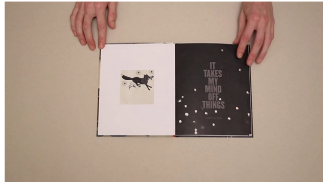
'It takes my mind off things' Graduation Dummy , 2014 2:49