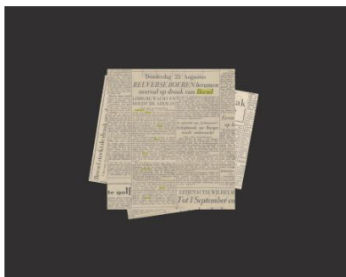
Dragonblood, Meuse newspaper collection, 2019, 2020 C-print, various