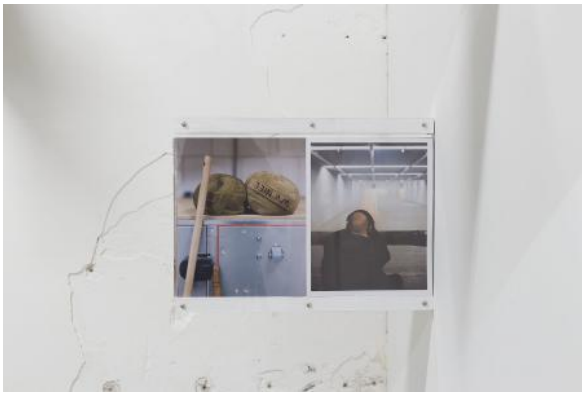
auto_awesome Vertalen uit het: Engels volume_up 105 / 5000 Vertaalresultaten Close up exhibition, Hoogtij # 48, "It takes my mind off things", A gallery Named Sue, The Hague 2017", 2017 Different media techniques , Various sizes