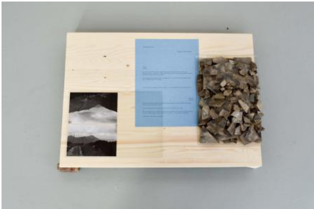
The first inscription (thanks Moshe), 2021 Mixed media