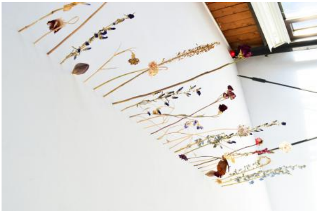
accusers/confessions (Trying to resist the urge to fall) , 2021 Mixed media