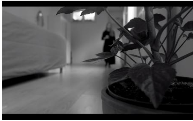
Smoke, 2021 Video