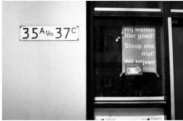
Annotations on Afrikaanderwijk, 2019 Printed matter