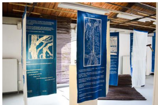
metrics of a temporary dwelling, 2022 Video