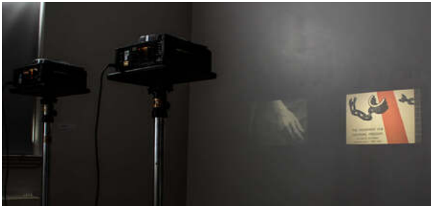
Between a Gaze and a Gesture, 2017 Synchronised slide projectors