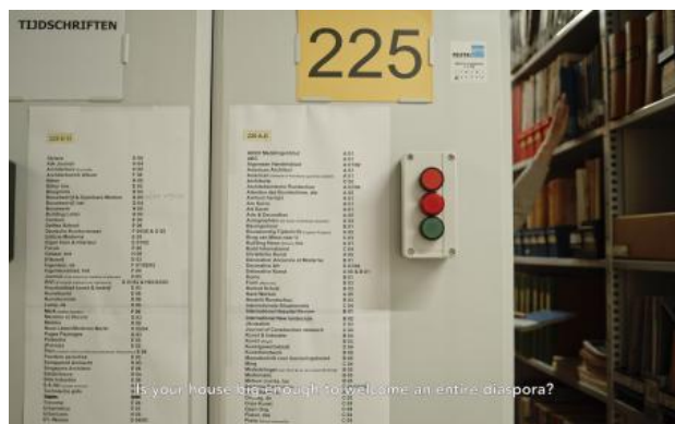
blueprints, constructing the membrane of a temporary dwelling..., 2022 Mixed media