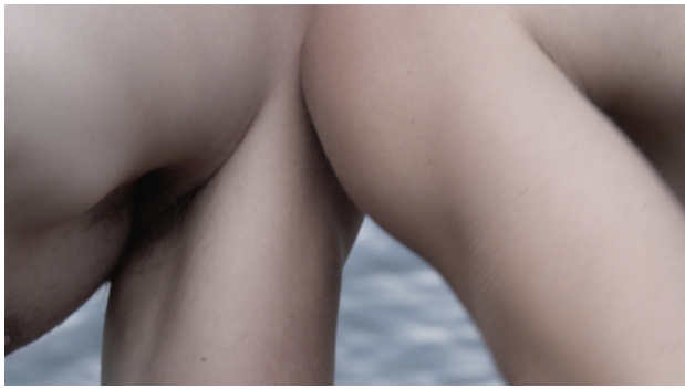
Robota, 2018 one channel video and sound installation