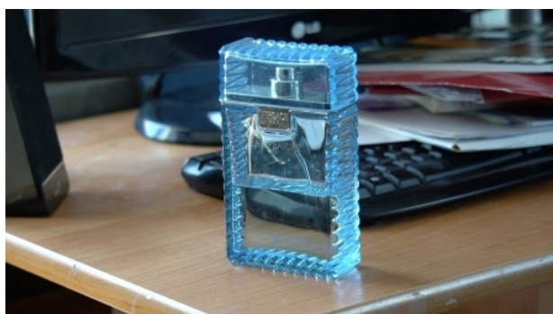
Robota, 2018 one channel video and sound installation