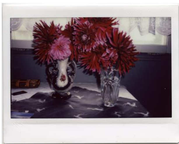
Mirek's Dahlas, 2021, 2021 Fuji Film Polaroid, 99 mm x 62 mm