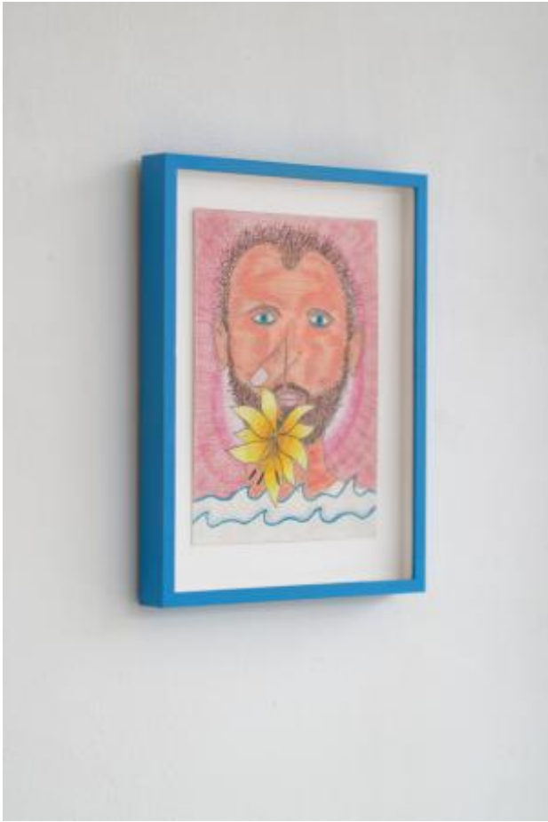
And on the threshold of balance, 2022 pencil and paper, 14,8 x 21 cm