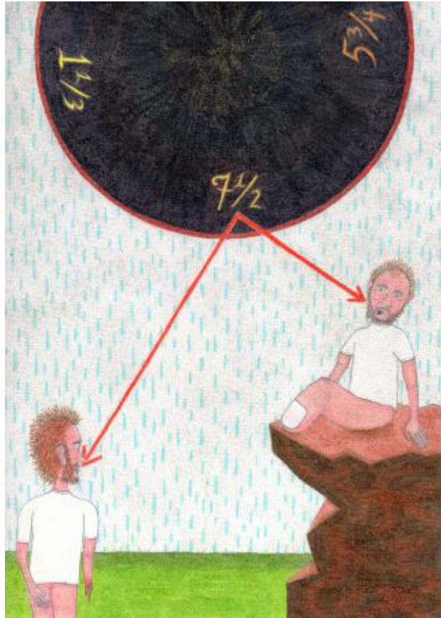
The fool, 2024 pencil and paper, 14,8 x 21 cm