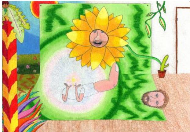
Untitled (studio view 3), 2023 pencil and paper, 21 x 14,8 cm