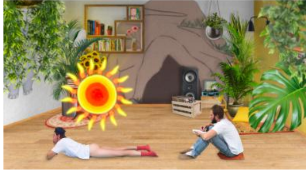
Beep (Piep) Beep (Piep) Buzz (Zoem) Beep (Piep) Buzz (Zoem), 2022 Video (20 min.)