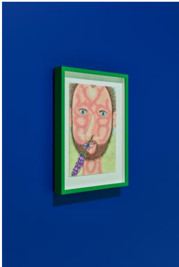
And then the next morning, 2022 pencil and paper, 14,8 x 21 cm