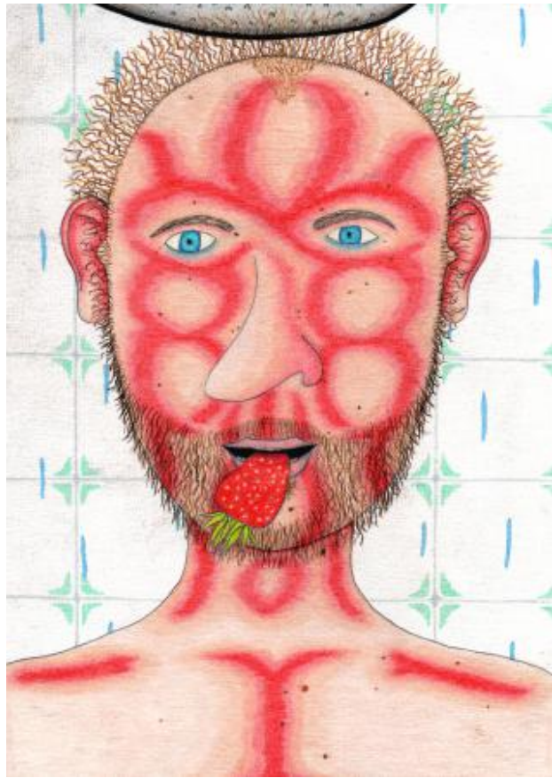
And then the new mornings, 2023 pencil and paper, 14,8 x 21 cm