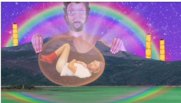
Beep (Piep) Beep (Piep) Buzz (Zoem) Beep (Piep) Buzz (Zoem), 2023 Video (20 min.), -