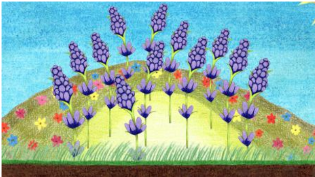
Towards tranquility, sanguinity, 2024 video (10:59), -