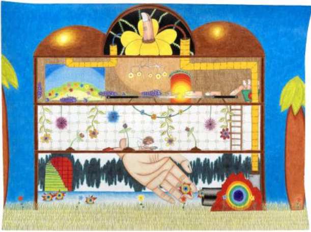
The house, 2024 pencil and paper, 29,6 x 40 cm