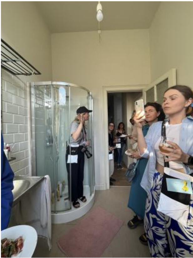
The Residency Tour, 2022 Performance, Stained Glass Window