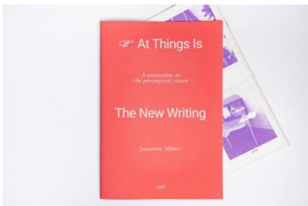
Pointing at things is the new writing, 2023 Publication