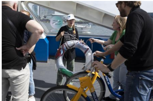
Verdwaal van hier naar daar vandaan dwaal af, 2022