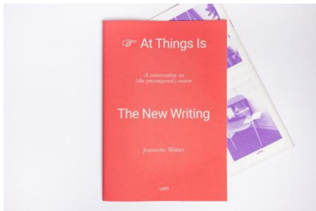
Pointing at things is the new writing, 2023 Publication