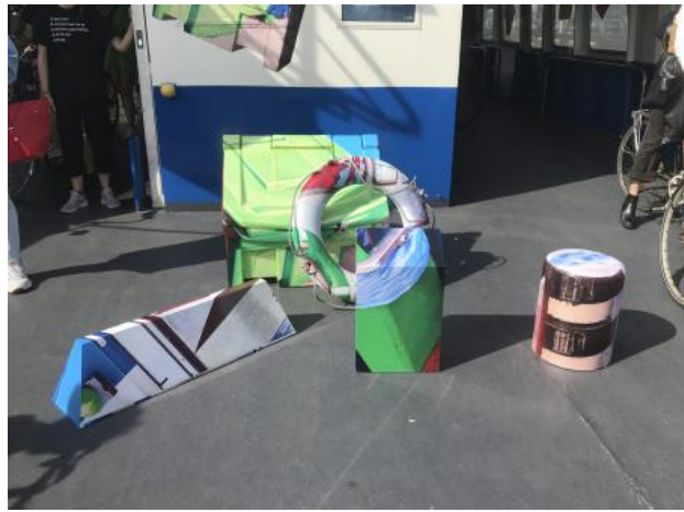
Verdwaal van hier naar daar vandaan dwaal af, 2022 Objects, Photoprint