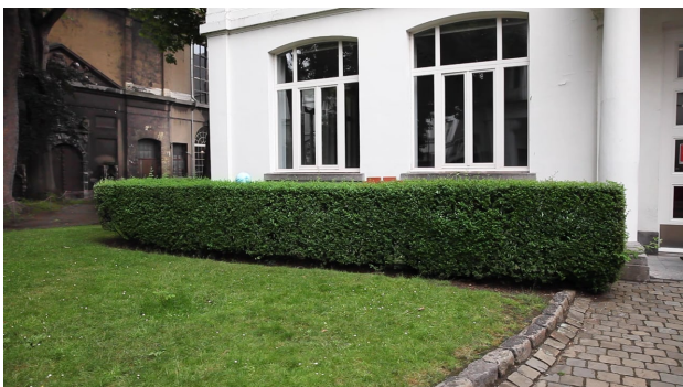
I found a shortcut through your hedge, 2021