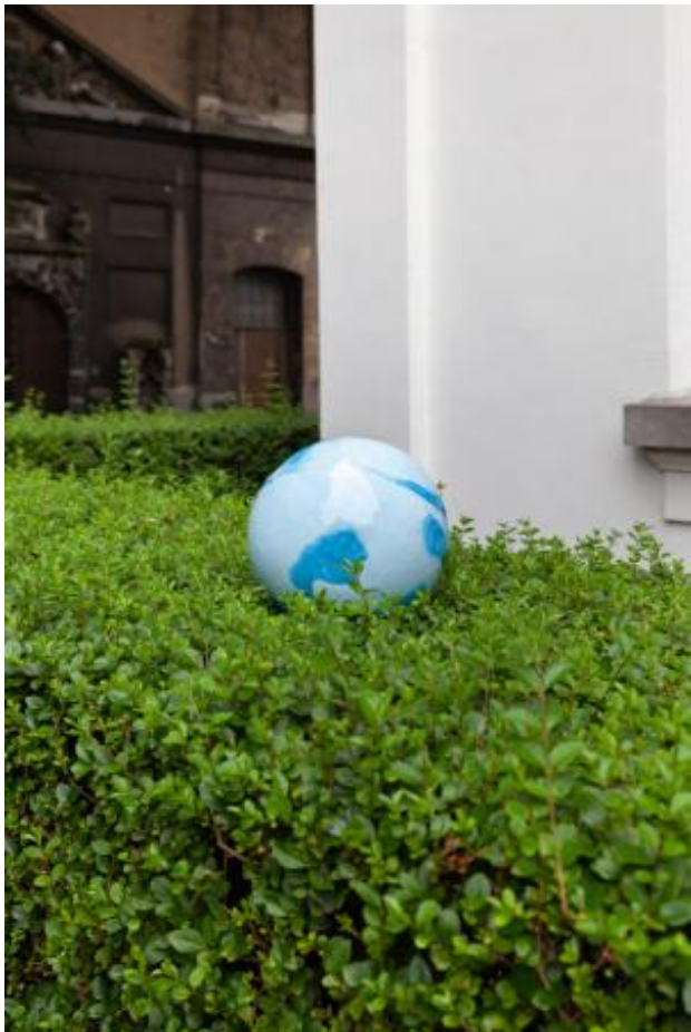
I found a shortcut through your hedge, 2021