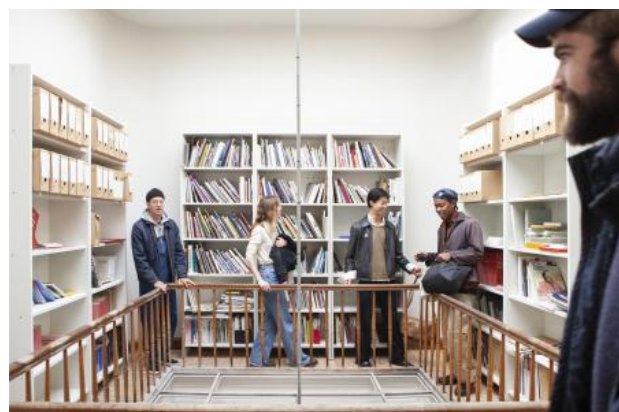
The Residency Tour, 2022 Performance, Stained Glass Window