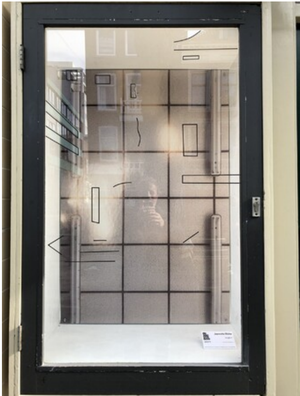
Angle II, 2020 Installation