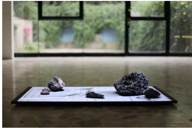
mineral everybodies II, 2023 video installation, 70 x 120 x 40 cm; 22min