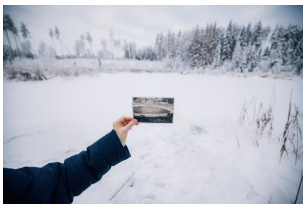
"wa(l)king the meteorite", 2023 video documentation with live voiceover, 8min reading and video