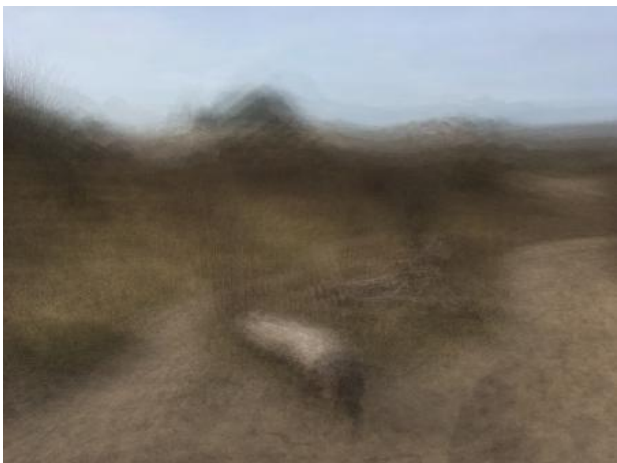
half-hidden, moss-driven, cloud-like, 2021 series of six digital photographs and field notes, shown online