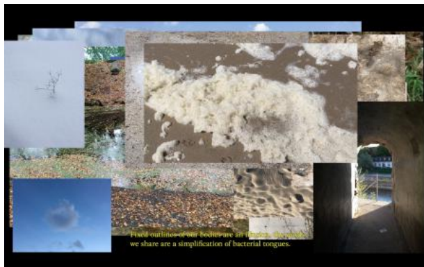
every second is kissed by billions of lips (love letter to 'dierkens'), 2023 video; 7,5min, projected on 200x112,5cm screen