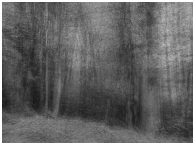
time is an animal, 2024 digital image, work-in-progress