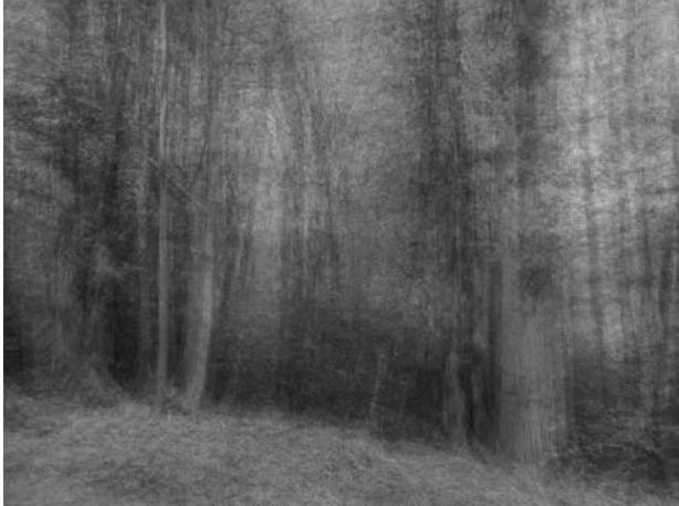
time is an animal, 2024 digital image, work-in-progress