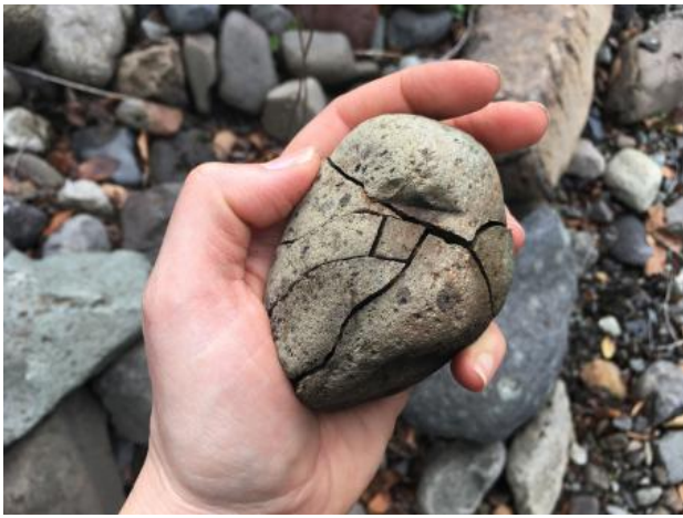
Research 'Black Earth' project, 2022 various media, variable