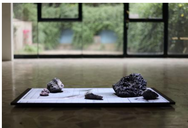
mineral everybodies II, 2023 video installation, 70 x 120 x 40 cm; 22min