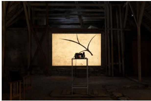
KŌDU / THE REST, 2022 herbal slide installation and slide projection, ca 200x150 cm projection + 100 5x5 cm slides