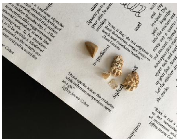
Stone Network, 2022 embodiment gathering, variable