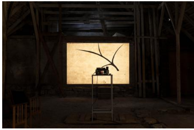
KŌDU / THE REST, 2022 herbal slide installation and slide projection, ca 200x150 cm projection + 100 5x5 cm slides