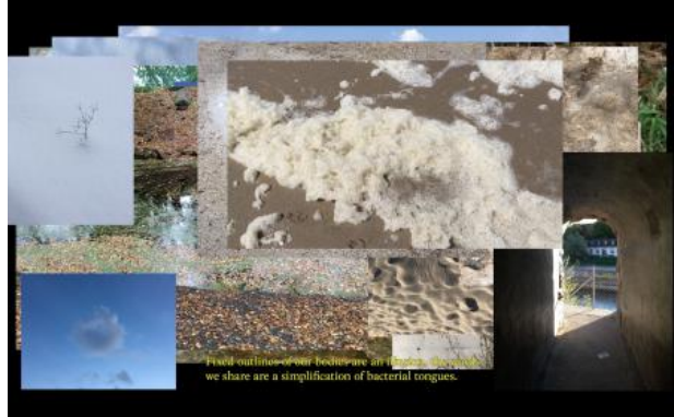
every second is kissed by billions of lips (love letter to 'dierkens'), 2023 video; 7,5min, projected on 200x112,5cm screen