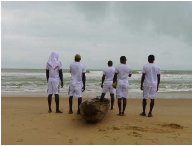
Lampedusa, 2015 Video Installation and photos, -