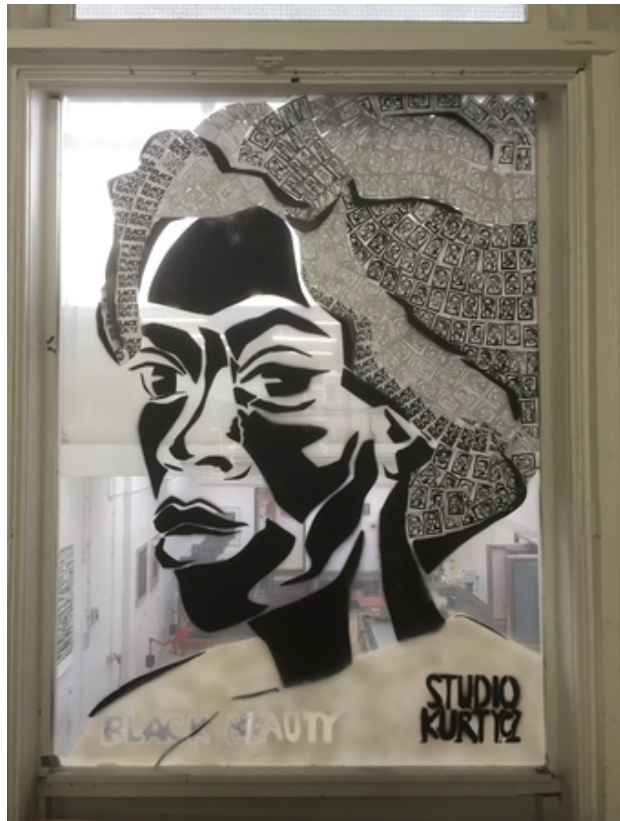
Black Beauty, 2016 Collage, stencil