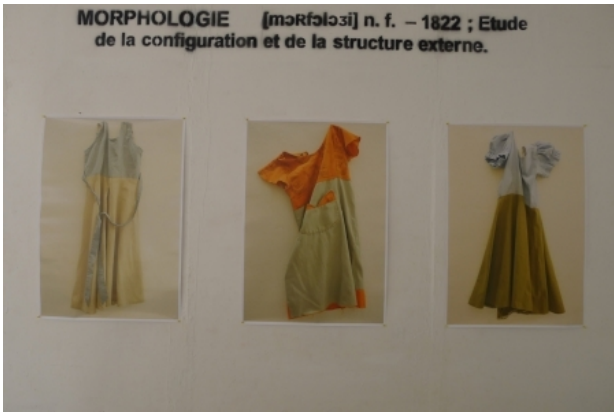
Morphologie, 2014 Installation: photos, stencil, woodcuts a, -