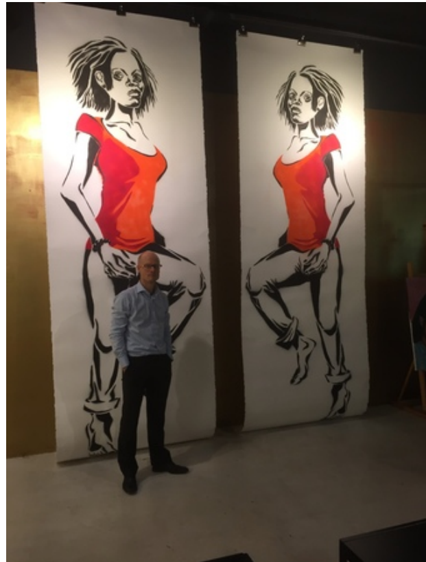
Danseuses, 2017 Stencil graffiti op papier, 400 x 132 cm