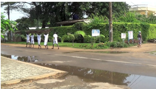
Lampedusa, 2015 9 min