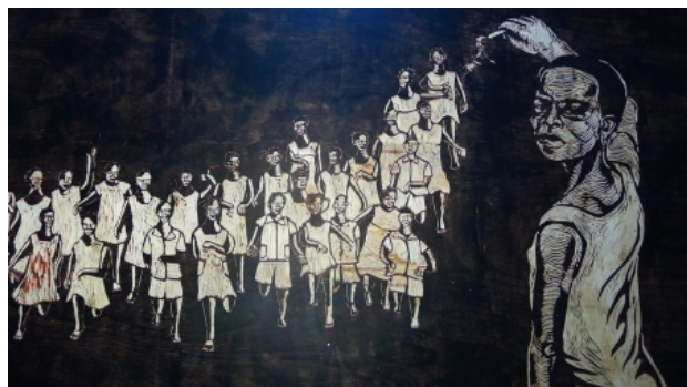
La leçon uniforme, 2015 Installation. Blackboard engraved and sc, -