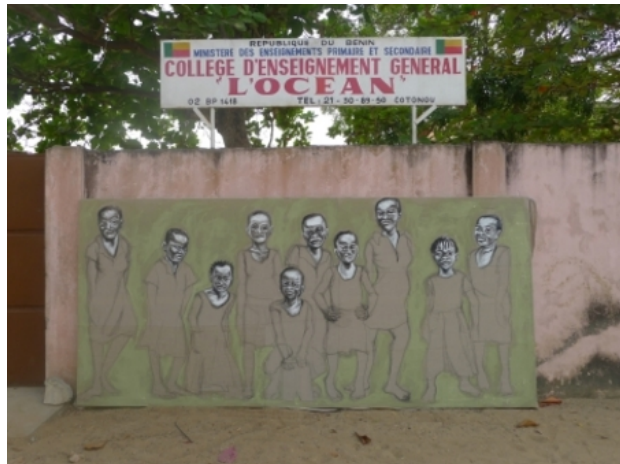
Filles en uniforme, 2015 Acrylics on Canvas + performance and vid, -