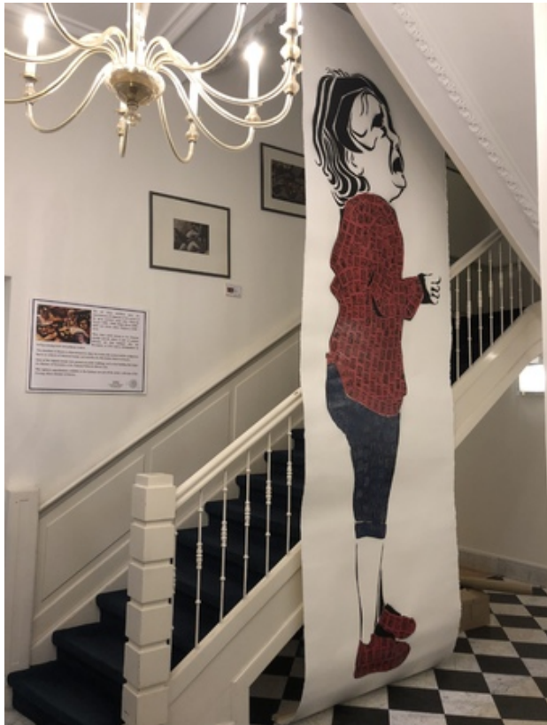
Migración: juego de niños, 2019 Collage, prints + stencil op papier, 400 x 132 cm