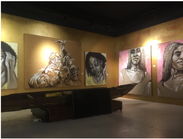
Perspectives on departure, 2016 Mixed, Overview