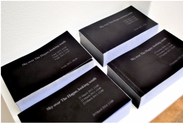
Why is the crow like a writing desk, 2013 installation, variable