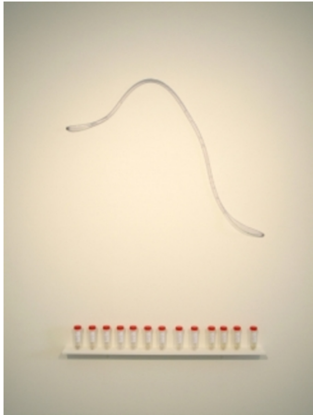
Is the bridge flowing or the river, 2012 installation, variable