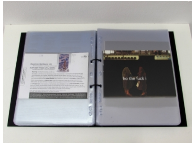
in de Galerij, 2015 installation, variable