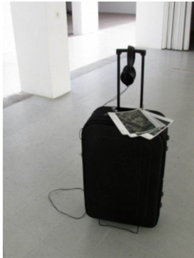
Trac(e/k), 2014 installation-sound, variable