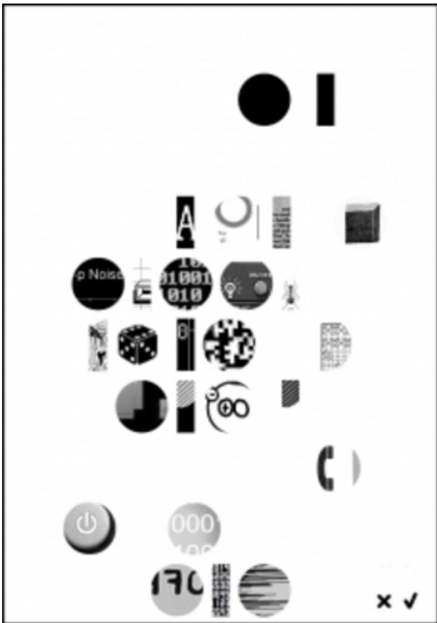
A4s, 2014 booklet, A4