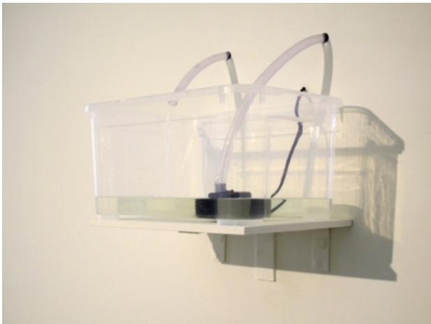
Is the bridge flowing or the river, 2012 installation, variable