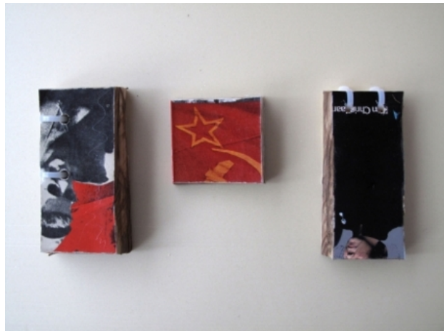
Instead of words, 2012 installation, variable