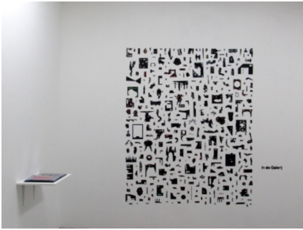
in de Galerij, 2015 installation, variable