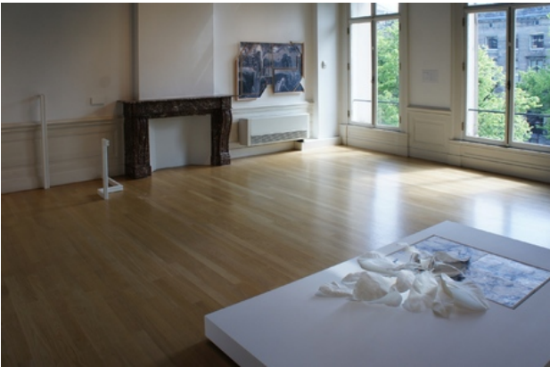
Foam 3h, 2019